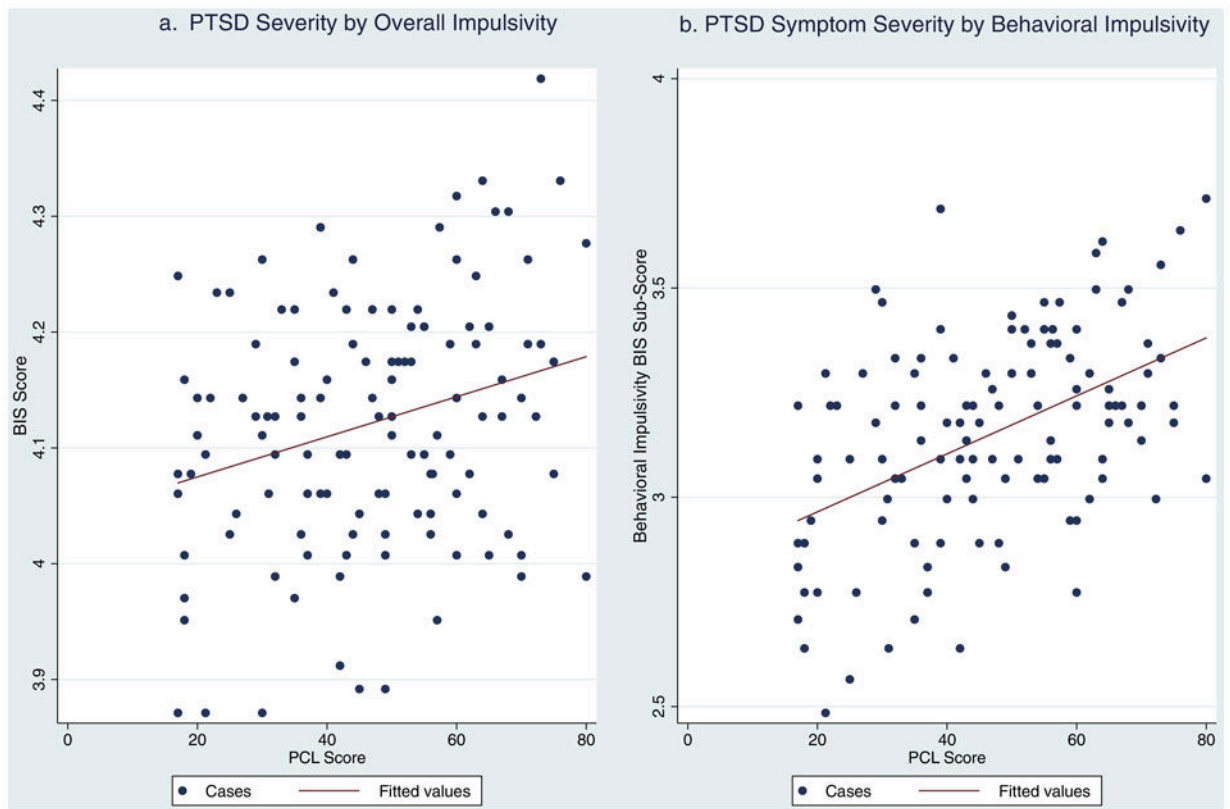
Figure 1. Note: BIS-11 scores were log transformed