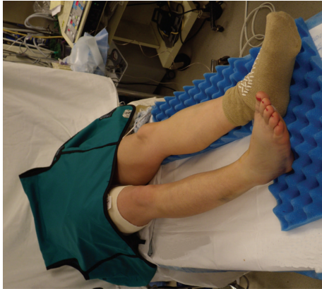
FIGURE 3: Preoperative positioning of a pregnant patient with a bump under the right hip and a lead apron draped over the abdomen and pelvis.

Placing the patient supine during this time can result in compression of the inferior vena cava by the uterus, which in turn can reduce maternal cardiac output by up to 30% and cause alterations in uteroplacental blood flow [7]. This compressive effect can be partially relieved or eliminated by angling the patient's body to the left during positioning (Figure 3). The lateral decubitus position is ideal, but the necessity of certain surgical approaches may prevent its use. In our case, the patient required a lateral incision over the left ankle as part of the planned repair, so a left lateral decubitus position was not possible. However, even though a bump was used under her right side, the fact that our patient was placed supine for the planned ankle fixation may have contributed somewhat to the onset of the observed fetal heart rate abnormalities. This highlights the importance of the orthopaedic surgeon being cognizant and flexible in terms of positioning a pregnant patient. It is recommended to avoid a purely supine position if possible. Placing a wedge under the right hip and/or tilting the operating table can help in positioning if desired.