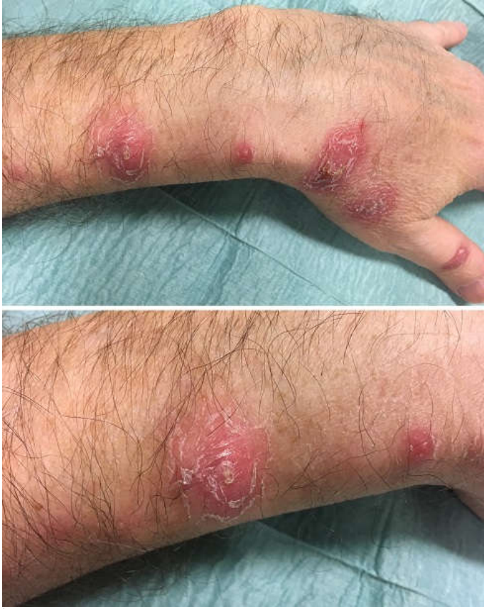
Figure 1. Multiple linear erythematous nodules along the lateral aspect of the left hand and forearm and close-up of one of the lesions.