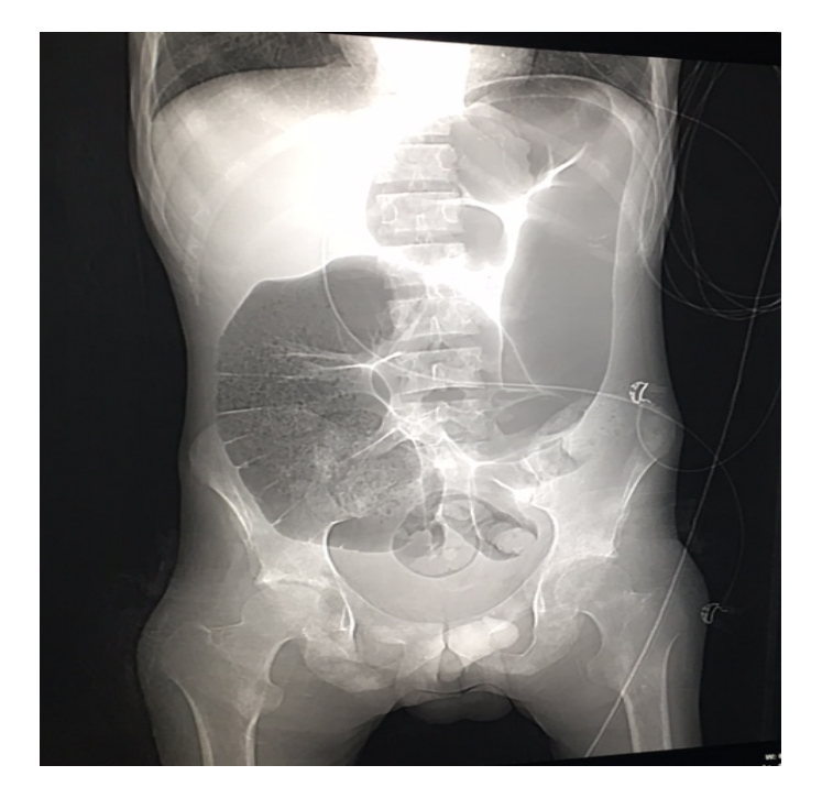
Figure 2. Descending colon spasm. Swirl sign.

Figure 1. Dialted loops of bowel, large colon. Absence of air in the rectum. Coffee bean sign.