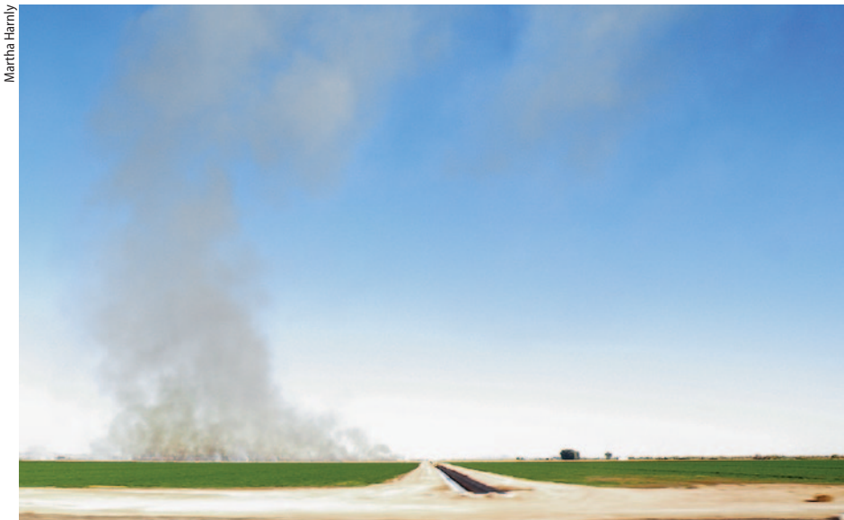
At a monitored burn near Holtville, the ground-level wind direction was to the north, but the upper-level plume at the apparent inversion layer moved to the south.

Farmers. Of 30 farmers that we contacted, three agreed to participate. All three burned bermudagrass or wheat fields, thousands of acres in some years. The farmers discussed the benefits: as one explained, “Burned fields are more profitable.” All had considered disking their fields or using minimum tillage as an alternative to burning, which they had learned about by trial and error. All three discussed a certificate program used by the Air Pollution Control District to accredit and stimulate financial rewards for farmers who do not burn (Imperial County APCD 2010). All three also had voluntarily notified their neighbors about planned field burns. (Since this study was completed, Imperial County Air Pollution Control District has begun requiring notification of neighbors within one-half mile of a burn [Imperial County APCD 2010]).