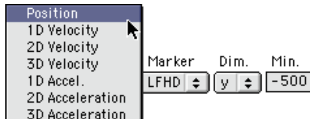
Figure 2. Input Selection in MCMMax

The motion capture data received from the Vicon system consists of x , y , z position values for each marker being tracked. In addition to the position of any marker in any dimension, MCMMax allows the user to track other information: marker velocity in one, two, or three dimensions; marker acceleration in one, two, or three dimensions; the distance between any two markers; and the angle formed by any two or three markers. As with the basic version of MCM, one can specify a range of input values to track.