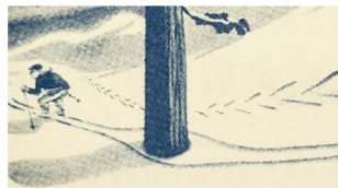
Figure 1. Coming from Charles Addams, The New Yorker , 1940.

The double-slit experiment with electrons and real slits is eventually performed by the original scheme from Feynman, they emit electrons onto the double slits, and via collecting the transmitted electrons with a -electron detector, the double-slit interference pattern is shown 10 .