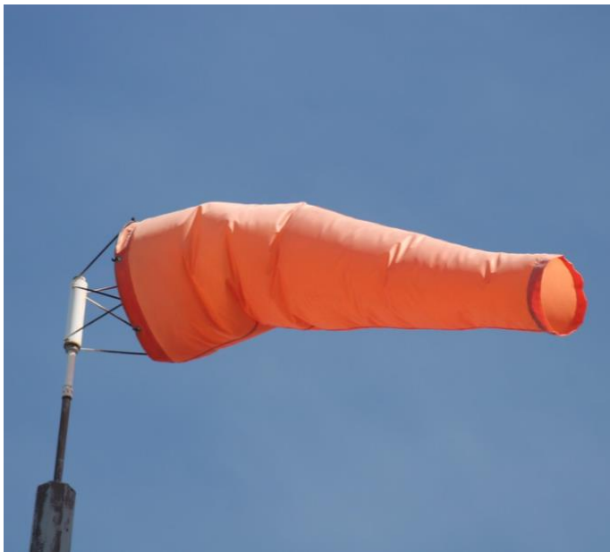
Figure 3. Windssock 9

A conically shaped segmented tube devised to measure the speed and direction of wind gave its name to a characteristic radiologic appearance of intraluminal duodenal diverticulum formed by passive elongation of congenital duodenal web due to peristalsis.