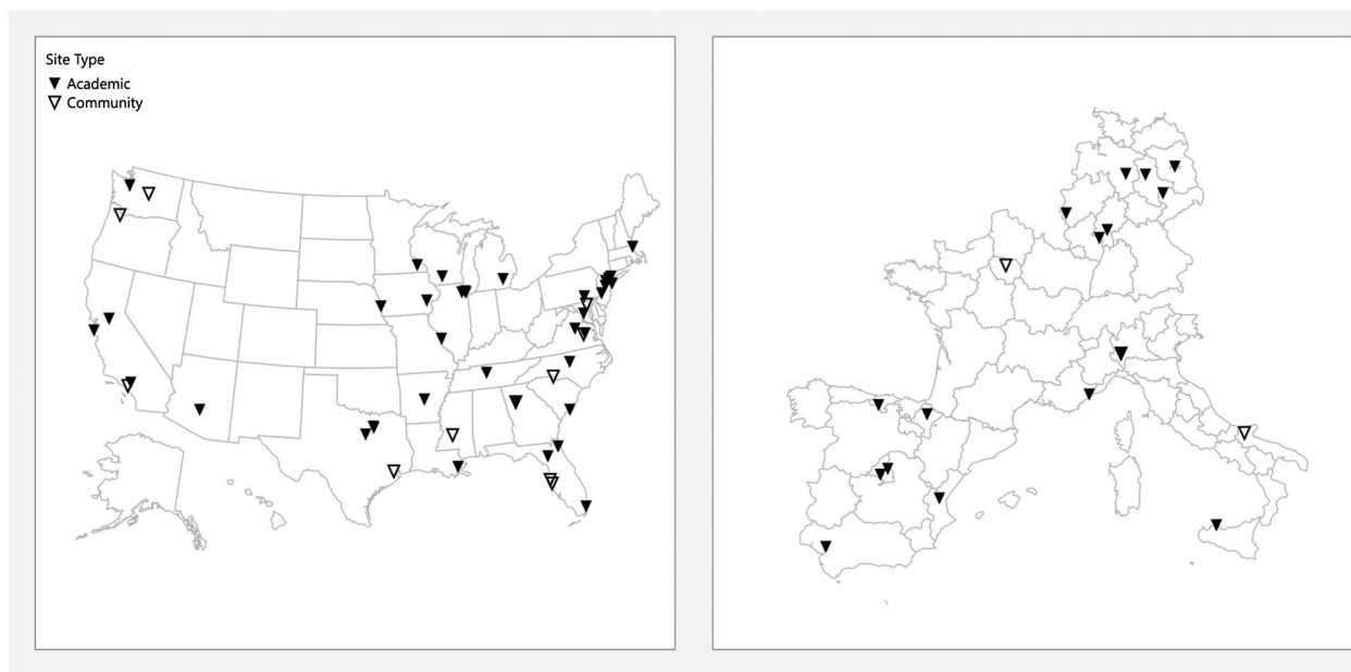
FIG. 1. TARGET-HCC sites in the United States and Europe. Maps illustrating the location of sites in the United States and Europe participating in TARGET-HCC; 84% of sites are located in the academic setting, 16% of sites are located in the community setting.

TARGET-HCC is an ongoing, longitudinal, observational cohort of patients receiving medical care for HCC in usual clinical practice across both academic institutions and community practice sites in both the United States and Europe (Fig. 1). The primary aims of TARGET-HCC are to define the natural history of HCC and to estimate the association between therapeutic interventions for HCC and subsequent health outcomes in a real-world setting. Secondary aims include i) evaluation of the impact of HCC treatment interventions and concomitant medications on comorbid conditions and liver function and patient-reported outcome (PRO) measures during the natural course of HCC and management with health-related quality of life questionnaires and ii) establishing a Biorepository Specimen Bank. Exploratory aims include investigation of optimal type, duration, and sequence/combination of treatment interventions for HCC used in