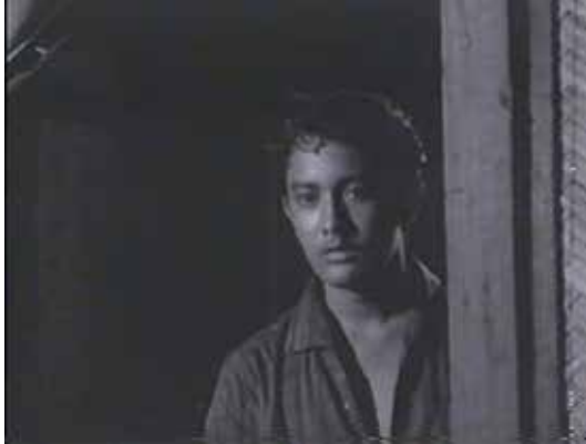
FIG. 4. A stunned roommate witnesses his friends' transformation into aswang in Mga Bata ng Lagim .