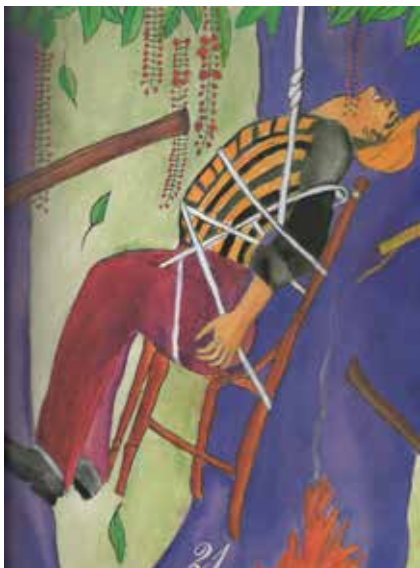
FIG. 2. Although folkloric and anthropological accounts mention aswang women as the object of these violent cures, Gilda Cordero-Fernando includes an ironic illustration of a tortured husband subjected to this remedy in The Aswang Inquiry . Courtesy of Gilda Cordero-Fernando.

Folklorists classify such tales under motif number “G299.5 Cure for witches (so she will cease to be a witch)” (Eugenio, Philippine Folk Literature 145-147). However, these tale types make no mention of the violence against women inscribed in these stories, which, from a queer/feminist perspective sympathetic to aswang, read like stories of spousal abuse in the name of reforming deviant lovers and effecting their return to heteronormativity. In what I read as an ironizing move, Cordero-Fernando replaces the figure of the aswang wife with that of a tortured husband, seated and struggling with his head thrown back in pain, when she illustrates such tales (see fig. 2).