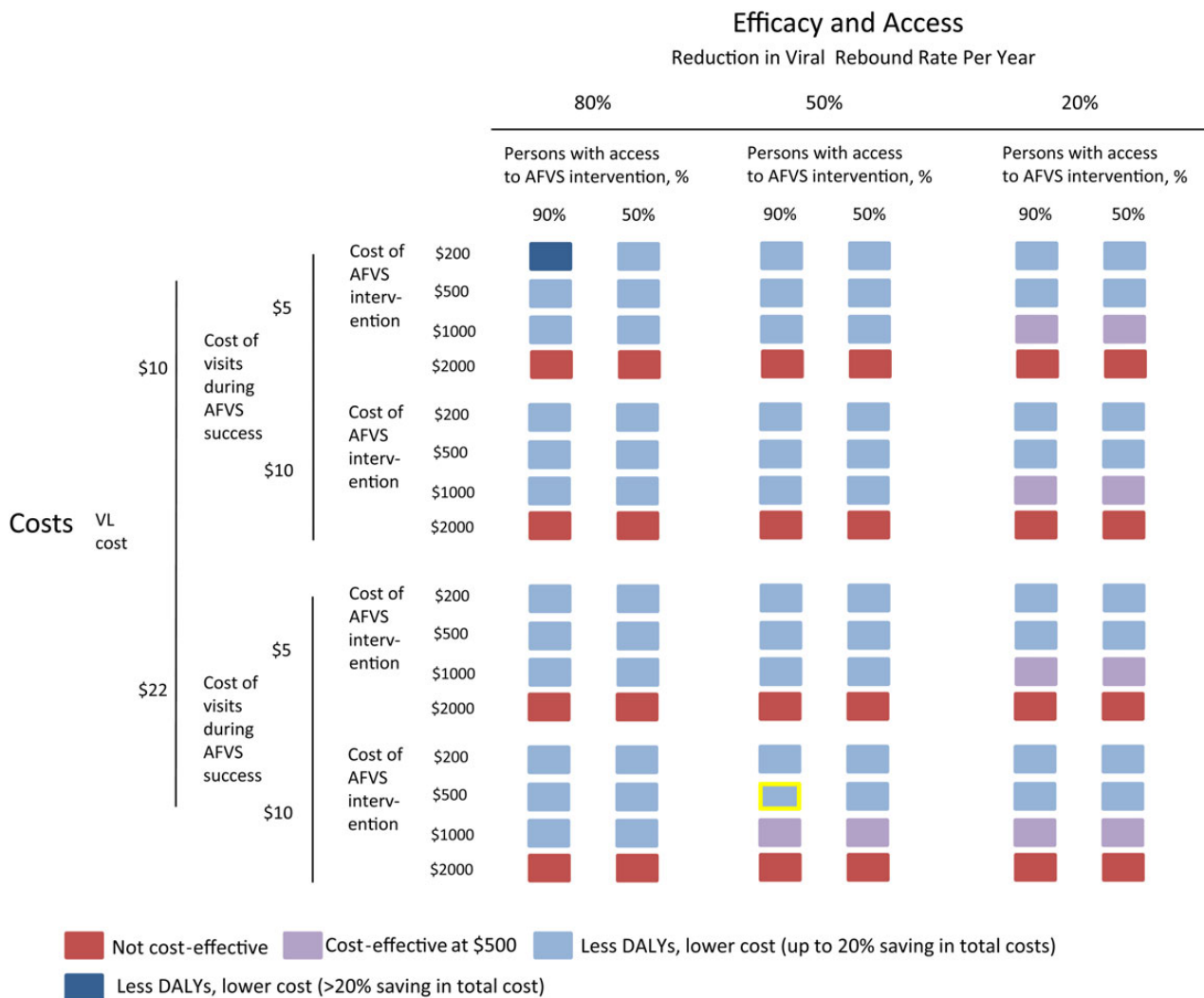
Figure 2. Results of multiway sensitivity analysis showing the effects of (1) efficacy and access of the antiretroviral therapy (ART)-free viral suppression (AFVS) intervention and (2) unit costs, on cost-effectiveness and level of cost saving. In the context of the base case, highlighted—90% of persons with access, 50% reduction in viral rebound rate per year, $22 for cost of viral load (VL), $10 for cost of visits during AFVS—the threshold cost of the AFVS intervention to be cost-effective was $1400, and the threshold to be cost saving was $975. Abbreviation: DALYs, disability-adjusted life years.

In this modeling and economic evaluation we have assessed what properties an intervention aimed at HIV cure should have for it to represent a cost-effective option in low-resource settings. The