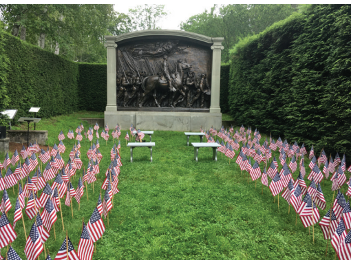
LEFT TO RIGHT Shaw Memorial | Birch allée | Little Studio

In this 27th Letter From Woodstock, it is difficult not to take a more cynical view of what could be dismissed as juvenile hooliganism. It feels like we are seeing a disturbing erosion of normative behavior across America. In our body politic, violent rhetoric begets physical violence. Both create a permissive climate for truly outrageous behavior that otherwise might be self-censored. This was not the first time late-night vandalism had been inflicted on Saint-Gaudens such as overturning planters on Halloween. Some would say that graffiti is graffiti, just kids being kids. But this was not tagging a bridge abutment with the initials of someone’s girlfriend. This desecration was a hateful and offensive attack on a national park—on a creation of democracy and a singular representation of national unity and comity. Whoever did this, took their cue from hateful and offensive adult behavior, all too pervasive on social media and in today’s toxic, anti-government political culture.