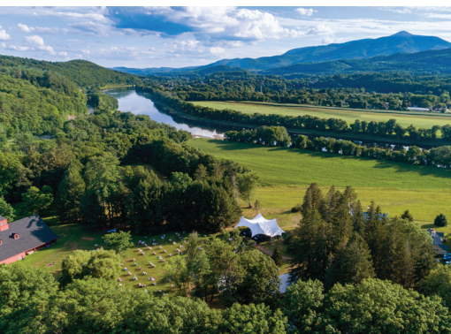
LEFT TO RIGHT Blow-Me-Down Farm OPERA NORTH | Farm barn NATIONAL PARK SERVICE | Rehabilitated 18th-century farmhouse NATIONAL PARK SERVICE