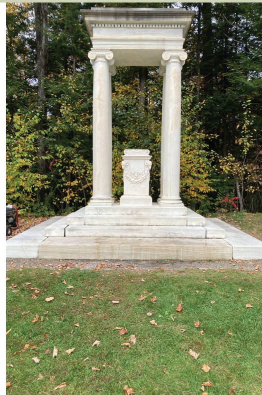
Repair of the “Temple Monument,” and the monument after treatment.