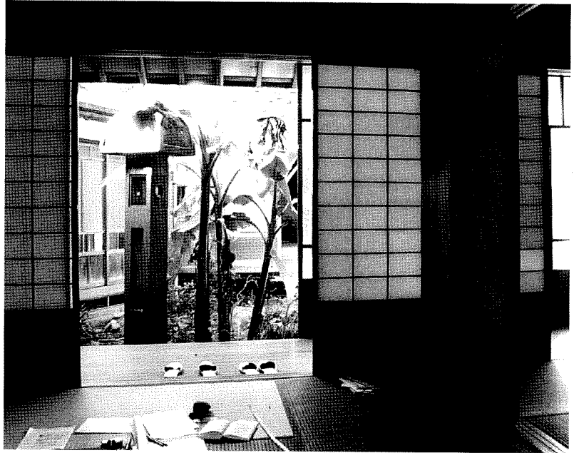
The sense of telescoping space provides an infinity of views, never precisely remembered and always new.

The garden changes little. It simply exists, offering views of green leaves and blue sky, wet stones and freshly laundered clothes lightly moving on a hot summer afternoon, and reminding one that some things are continuous in a life of insistent change.