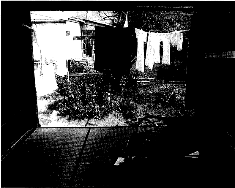
The colorful line of laundered clothes is a bright accessory to the dark house; it is like the banners that decorate religious buildings during festivals.

smell of damp earth. Insect screens attached to the room opening also form a visual barrier between the inside and outdoors, and they reduce the flow of air.