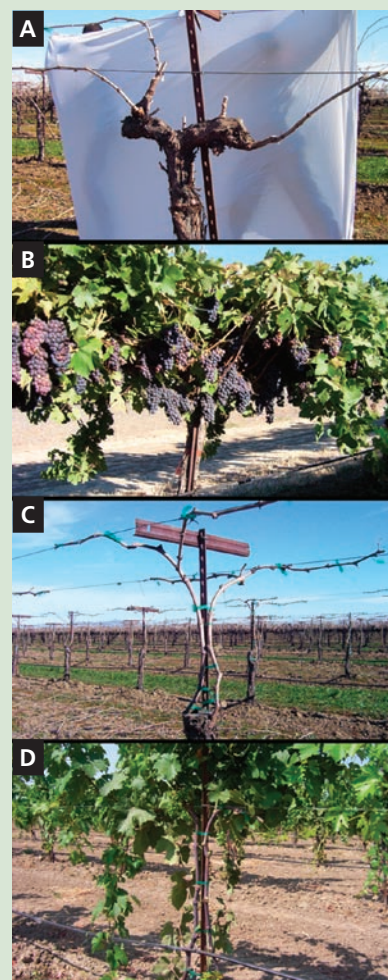
In 'Zinfandel' vines mildly infected with Botryosphaeria obtusa , (A) infected cordon wood was removed, and cane pruning replaced spur pruning and (B) regrowth was treated by removing the cordon portion with dead spurs; in severely infected vines, (C) almost all of the scion was removed and new canes were trained and (D) most of the cordon was removed.

Severe Botryosphaeria infections may require a different approach. We have successfully left the infected cordons in place and utilized cane pruning with the remaining healthy and productive wood. However, when the per-acre yield per block falls below an economically viable level, severe vine surgery (as opposed to vineyard replanting) will allow vines to stay in the ground and most of the trellis and drip irrigation system to remain intact. The cost for cutting vines above the graft union and about 12 inches from the ground (see photo C), removing and disposing of the upper portion of the vine and the cordon wire, painting the wound, reinstalling a new cordon wire, retraining and tying the vine, repairing trellises and conducting standard farming activities was about $4.20 per vine or about $2,200 per acre. This method should yield almost a full crop in the second year (see photo D). We are currently evaluating several training practices with the use of either two trunks to reestablish bilateral cordons or quadrilateral cordons, or training the vine for cane pruning (see photo D).