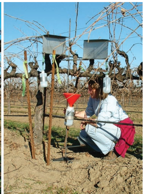
Stands were used to collect fungal spores disseminated in rainstorms. Left , each stand had a funnel under the cordon for estimating available inoculum within the vine, and a plate on the ground (2.5 inches high by 20 inches wide) at a 45° angle to collect splash from debris; right , stands also had two tented plates (8 inches high by 12 inches wide), which were designed to collect wind-blown rain.

to black streaks in a longitudinal section. B. obtusa isolates are pathogenic, and B. obtusa grows more quickly in woody tissue than E. lata (table 1). Our results are in agreement with other reports in which B. obtusa and other Botryosphaeria spp. are identified as important grapevine pathogens (Leavitt and Munnecke 1987; Phillips 1998, 2002; Savocchia et al. 2007; van Niekerk et al. 2004, 2006).