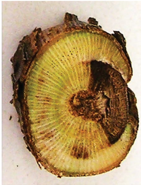
In a pathogenicity test, Botryosphaeria obtusa caused a wedge-shaped lesion.

face. After conidia are released during rainy weather and disseminated via wind-blown rain, the empty pycnidial cavities remain on the plant surface. B. obtusa pycnidia were never observed on grape berries, and no sexual spores of either Botryosphaeria spp. or E. lata were ever observed.