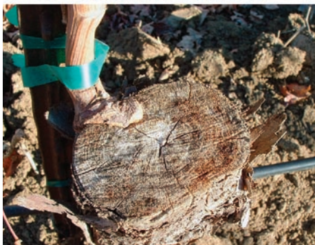
Top, Duration paint is being tested as a treatment for surgical cuts on grapevine trunks; lower, an untreated vine.

B. obtusa in 28% of asymptomatic shoots and 90% of symptomatic 1-year-old shoots (n = 54) 3 inches from the cordon. Symptomatic shoots that were surface-disinfected and incubated in a humid chamber at 74°F for 3 weeks produced B. obtusa pycnidia. Overall, our data are consistent with a life cycle in which B. obtusa grows asymptotically within grapevine shoots and woody tissue. We postulate that damage to the vine occurs primarily by the grapevine's release of self-defense compounds that kill its own cambium.