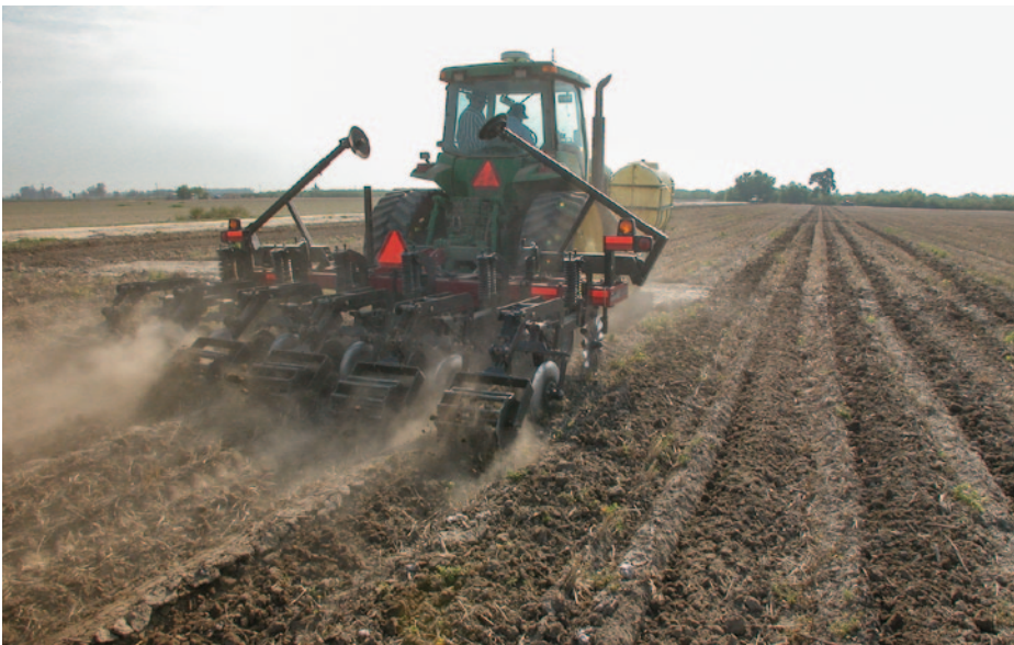
A Case DMI Ecolo-till six-row strip-tiller prepares seedbed strips prior to cotton seeding (in Riverdale, 2003), generating less dust and particulate matter than disking the entire field.

depending on factors such as soil texture, moisture content and aggregation. These affect the extent to which the soil fractures and permits good seedbed conditions following operations.