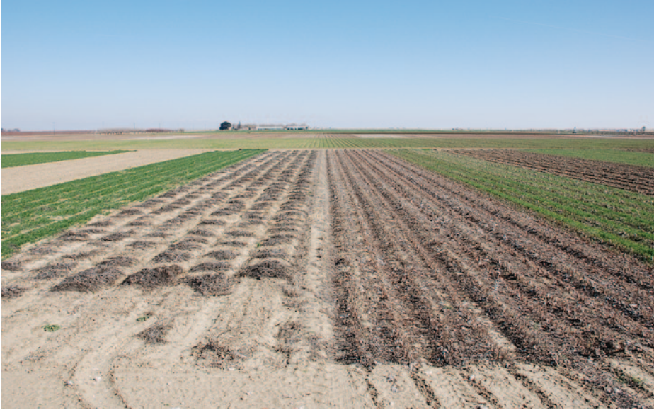
The field layout for the cotton-tomato rotation study shows postharvest tomato beds (left) and conservation tillage cotton beds (right), with and without a cover crop in Five Points, 2007. In later years of the study, cotton lint yields were similar for the conservation tillage and standard systems.