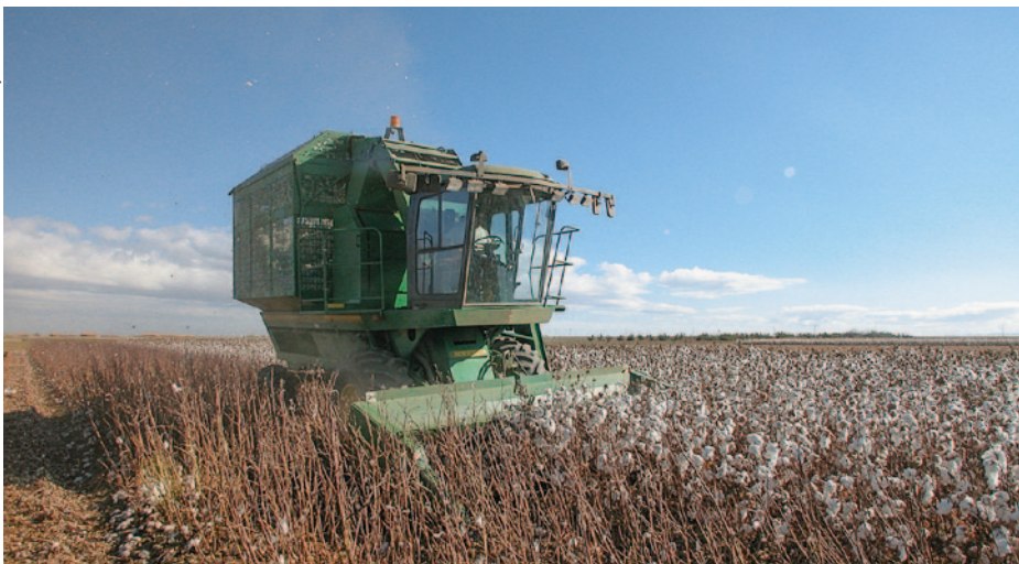
A stripper harvester is used to pick cotton in ultra-narrow rows in Five Points, 2007.