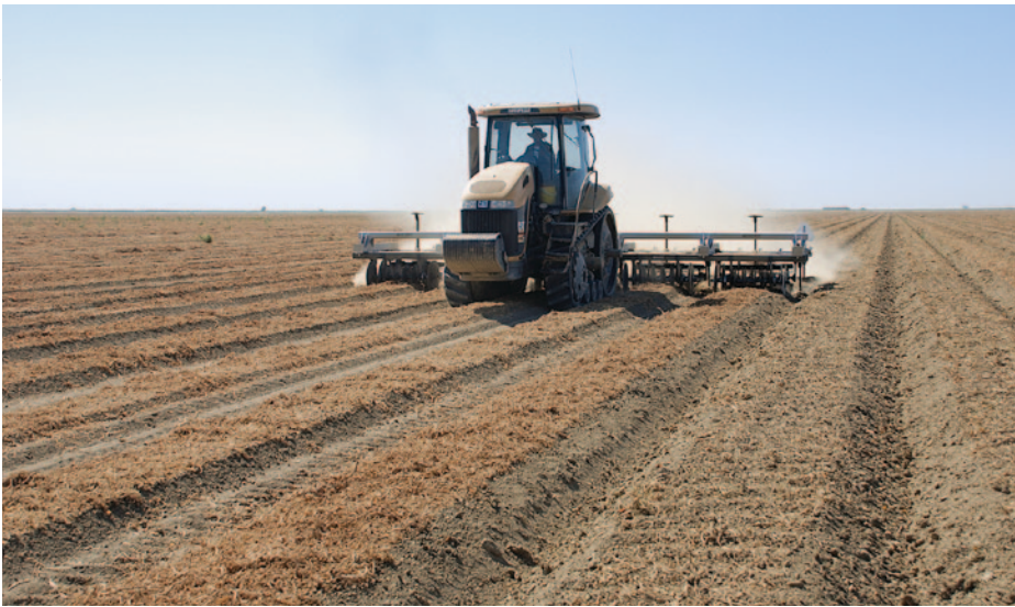
Fewer passes translate into about $70 less per acre spent on fuel, labor and repairs. A Wilcox Performer incorporates tomato postharvest residue before the next crop in Five Points, 2007.