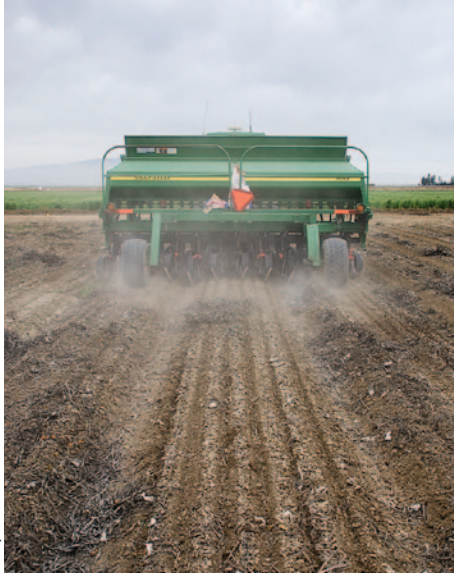
A John Deere 1560 15-foot no-tillage drill is used to seed cotton in ultra-narrow rows at 7.5-inch spacing in Five Points, 2007.

between no-tillage, strip tillage, reduced tillage and conventional tillage systems were not significant. The 5-year average profit for the no-tillage system ranged from $7 to $66 per acre higher than for the other three systems. This work concluded that farmers and crop consultants should consider overall profit rather than just crop yield when evaluating alternative tillage practices.