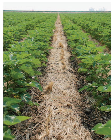
Jeffrey P. Mitchell

Glyphosate-resistant Acala cotton was grown in a winter triticale, rye and pea cover crop with no tillage in Five Points, 2007.