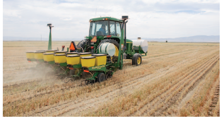
With conservation tillage a crop is seeded directly into wheat stubble, shown in Five Points, 2009.

refinement of conservation tillage systems in California. A wide range of innovative equipment has been introduced to the region, which has functioned successfully under various conditions. Whether conservation tillage has a larger future depends on two critical factors: the need to achieve vigorous crop stands and the need to avoid soil compaction.