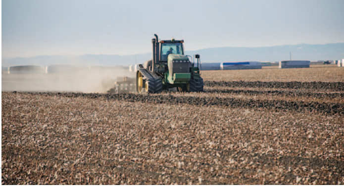
Standard postharvest cotton tillage includes shredding aboveground cotton plants and disking the residues as carried out in Firebaugh, 2007.