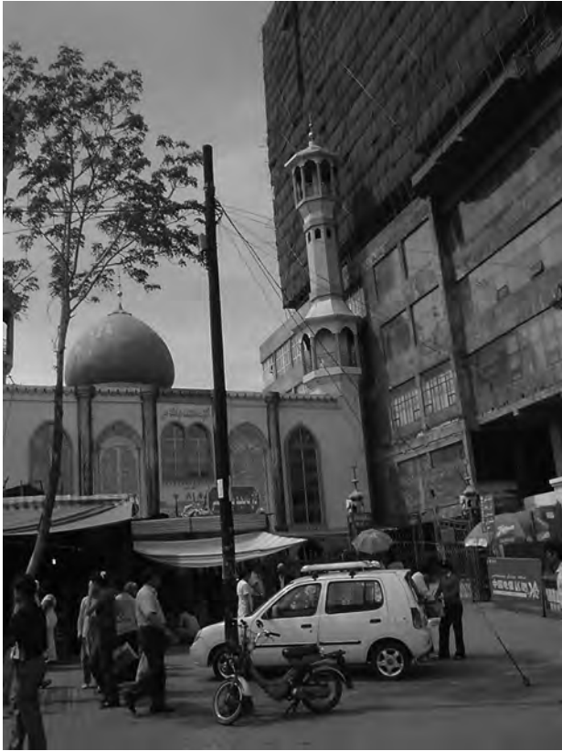
Figure 7.2. Uyghur mosque in Urumqi, Xinjiang Province.