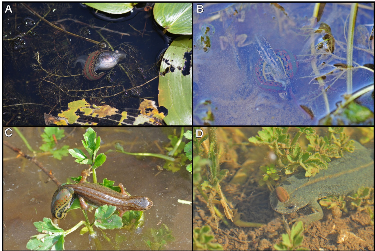
Figure 2. A: H. verbana feeding on Hyla intermedia (Site 14, August 25 th 2016, photo by S. Costa); B: H. verbana feeding on Hyla intermedia (site 1, August 4 th 2013, photo by A. Iannarelli); C: H. verbana feeding on Lissotriton vulgaris (Site 1, April 24 th 2018, photo by A. Iannarelli); D: H. verbana feeding on Triturus carnifex (Site 1, May 19 th 2013, photo by A. Iannarelli).

Hyla intermedia Boulenger, 1882, and in Abruzzo (site 1, Table 1), where it was observed feeding on H. intermedia tadpoles, and adult individuals of Lissotriton vulgaris meridionalis (Boulenger, 1882) and Triturus carnifex Laurenti, 1768 at several dates (Fig. 2). Although other Hirudo species are known to regularly feed on amphibians (e.g., Neubert and Neesemann 1999; Merilä and Sterner 2002), such observations are noteworthy for H. verbana , which is currently considered to use unglates as the main food resource (Kovalenko and Utevsky 2015), and its habit to feed on amphibians was to date documented only on Bufo bufo (Linnaeus, 1758) (Fontaneto et al. 1999). This feeding behaviour suggests that the presence of unglates is not a necessary prerequisite for habitat selection and species distribution.