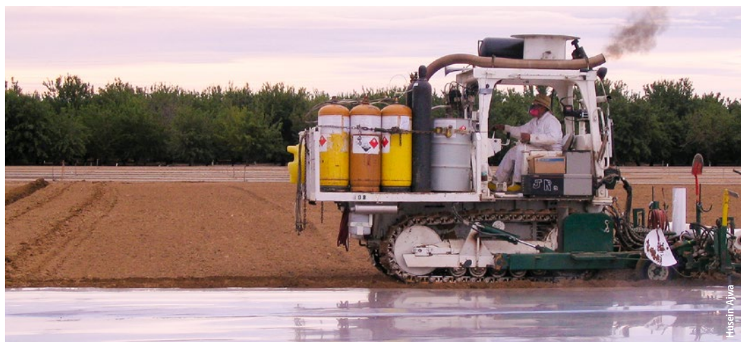
Tarping fields helps to retain fumigants in soil.

Incomplete mortality of V. dahliae (60% to 80%) was observed with all tested