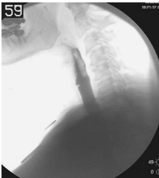
Fig. 1 Fluoroscopic lateral view demonstrating a thin anteriorly based web