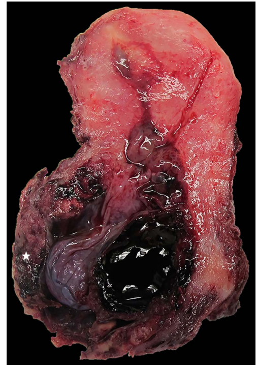
Figure 2 Bivalved uterus with caesarean scar pregnancy. Note the placental implantation and thinning of the anterior lower uterine segment (white star).

Caesarean delivery is associated with various complications, including abnormal placentation and caesarean scar pregnancies in subsequent gestations. 1 A theory exists that caesarean scar pregnancies and abnormal placentation may be manifestations of the same disease process. 2,3 Our case provides further histological evidence of placental increta after ultrasound diagnosis of caesarean scar pregnancy. With this knowledge, patient