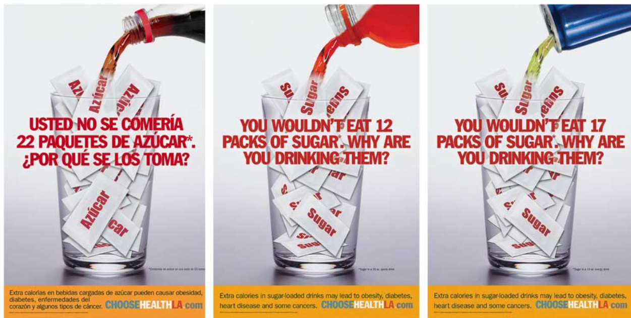
Fig. 1 (colour online) Choose Health LA ‘Sugar Pack’ health marketing campaign advertisements

The ‘Sugar Pack’ campaign ads focused on creative concepts designed to educate target populations about the high quantity of sugar contained in the following: (i) a generic 20 fl oz (591 ml) bottled soda; (ii) a generic 20 fl oz sports drink; and (iii) a generic 16 fl oz (473 ml) energy drink (Fig. 1). The soda ad depicted a generic soda bottle pouring sugar packets into a clear drinking glass (i.e. one filled to the brim with packets) and used a large bold font