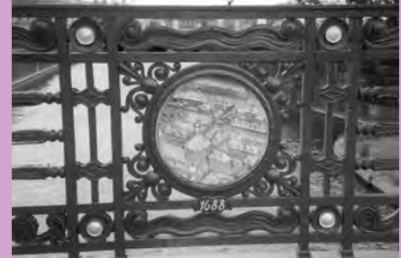
Telling the story of place in its structure. A sculpted metal panel on this nineteenth-century Berlin bridge depicts the growth of the city during the seventeenth century.

Today, the perspectives of the powerful are no longer the only stories