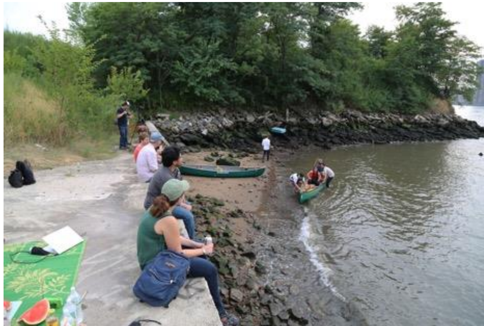
Fig. 4. The accidental beach at Hunters Point was an ideal place to land a boat while the bulkhead above an excellent place to relax and take in the views, 2015.

While much of the site's waterfront did not offer particularly easy physical access to the water itself given the steep, growth-covered bank that sat between the bluff and rough riprap, there was an accidental sand beach (sometimes disappearing at high tide) located below the bulkhead in a partially protected cove south of the Float Bridge, which could usually be accessed with a short jump. This was an ideal place to take your shoes off and get your feet wet, skip rocks, fish, launch or land a small boat; or enjoy the movement of the water lapping up against the stones, concrete chunks and weathered driftwood. It was also an excellent spot to observe the repeated dives of a cormorant in search of its next meal or watch a kingfisher sitting on an old pier piling patiently awaiting a similar opportunity snag a fish swimming too close to the surface of the water. The wide bulkhead above the beach was a similarly excellent spot to sunbathe or have a picnic, or simply take in the views sitting comfortably with feet dangling over the wall's edge (Fig. 4).