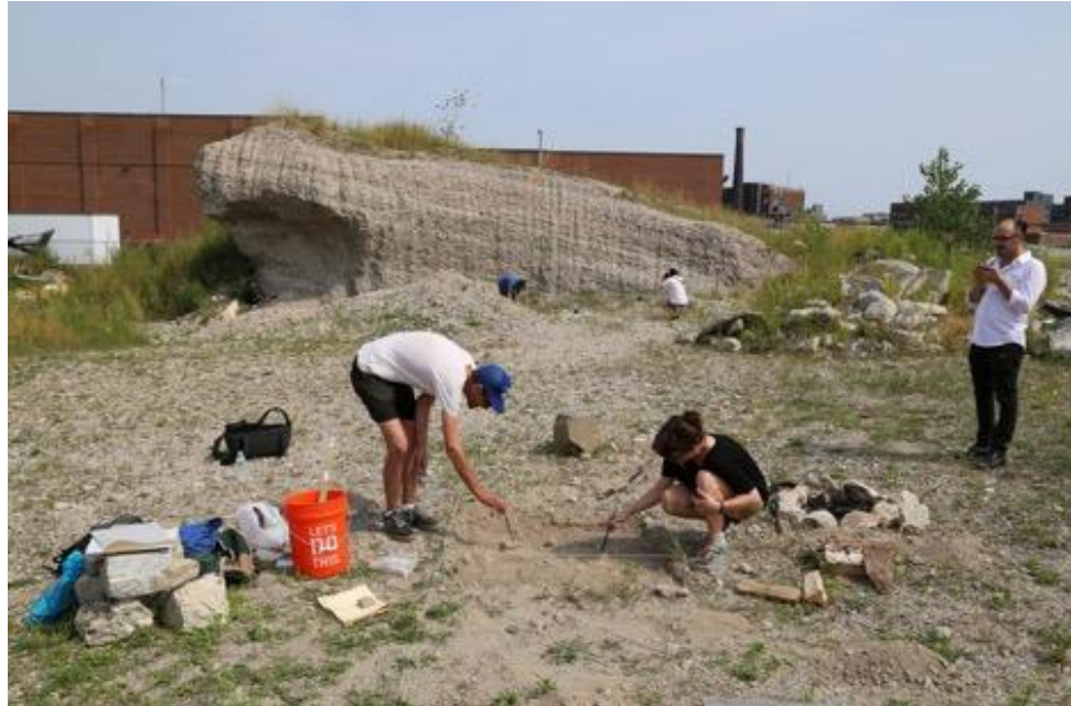
Fig. 9. Participants in a public investigation of the former Dock Street right-of-way, 2015.

The socially pliable conditions also enabled acts of discovery at greater scales and perspectives, including Laura Chipley's kite mapping project and Sarah Nelson Wright's collection of video and sounds that would eventually become a virtual-reality gallery installation. Using a solar powered transmitter from top of the hill with the flagpole, Dylan Gauthier's "Stolon Station" broadcasted pirate radio to the immediate vicinity. Gauthier's "stolon" was inspired by the rapid spreading of horizontal stems or shallow roots of an insurgent plant to form new plants at this site. During a late summer listening party, Hunters Point field recordings were broadcasted along with interviews and other auditory portions of Chance Ecologies programming (Fig. 10).