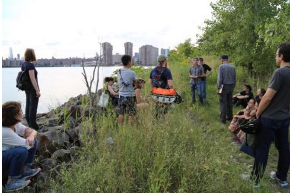
Fig. 8. “Unguided Tour” participants gather to enjoy the view and evening ambiance and discuss their nature experiences, 2015.

An unknowable number of other visitors to Hunters Point South over the years had encountered similar conditions, particularly in the summer, and perhaps appreciated a state of nature that wasn’t always relaxing, comfortable or safe. Hazards, natural or otherwise, were not limited to stands of thorn-covered bushes but also included poison ivy, mosquitos, wasps and other biting or and stinging insects, rodents, pollen and allergenic plant matter, hidden depressions, unstable surfaces that give way under the weight of feet, sharp objects, broken glass and all manner of wastes. This area was neither safe nor secure, and this was part of its appeal.