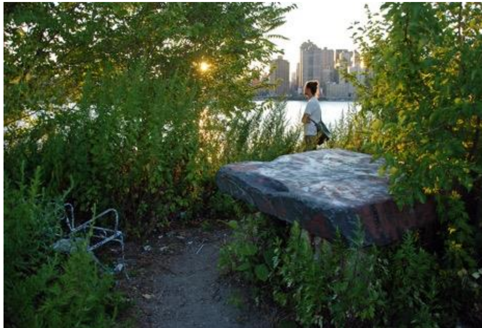
Fig. 5. A Chance Ecologies event participant convenes with the elemental during a sunset viewing, 2015.

With its west-facing waterfront, Hunters Point was also an ideal place to watch the sunset. Indeed, the inaugural Chance Ecologies event was a public sunset viewing (Fig. 5). Posters placed on the streets of Long Island City invited public participation, and the event began with an artist-led, silent walk to another clearing atop a small hill marked by a flagpole (no participants knew the origin or purpose of this flag pole on this artificial hill in the general area of where the Norval silos once stood). More generally, the soft afternoon light, filtering through the trees and tall grasses in some places, made the site an ideal place to savor the hours before dusk.