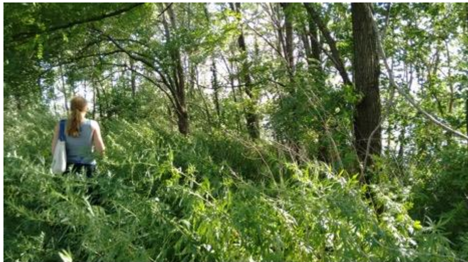
Fig. 6. "The Woods" at Hunters Point featured a generous canopy and thick underbrush, 2015.

Emerging from a combination of hard and soft ground conditions where the "soil" was often no more than crushed concrete or other demolition debris, was a hearty and surprisingly varied uncultivated plant life. Where this soil was the best and deepest (perhaps being "backfill" or soil dumped from a long-ago excavation elsewhere), Poplars, Mulberry, Ailanthus, and Honey Locusts reaching heights of 30 feet created a generous canopy that ran along the edge of the bluff and down the more gently sloping inland edge of this area often called "the Woods" by Chance Ecologies participants (Fig. 6). The impressive size of the trees and extent of the tree cover was best seen from the water – from the deck of the passing East River Ferry, whose dock was just two hundred yards north of the Woods. Underneath these uncultivated trees were dense thickets of thorn-covered bushes and various grasses. On the interior of the site, where there were no mature trees and the ground consisted mostly of construction debris and wastes, these thick and seemingly impassable shrubs predominated along with tall, stalky grasses.