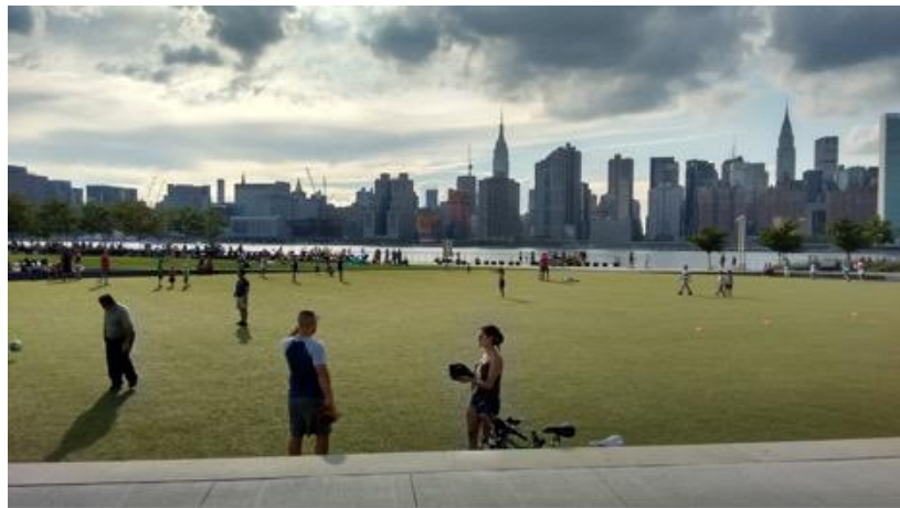
Fig. 3. The popular first phase of Hunters Point South Park, 2015.