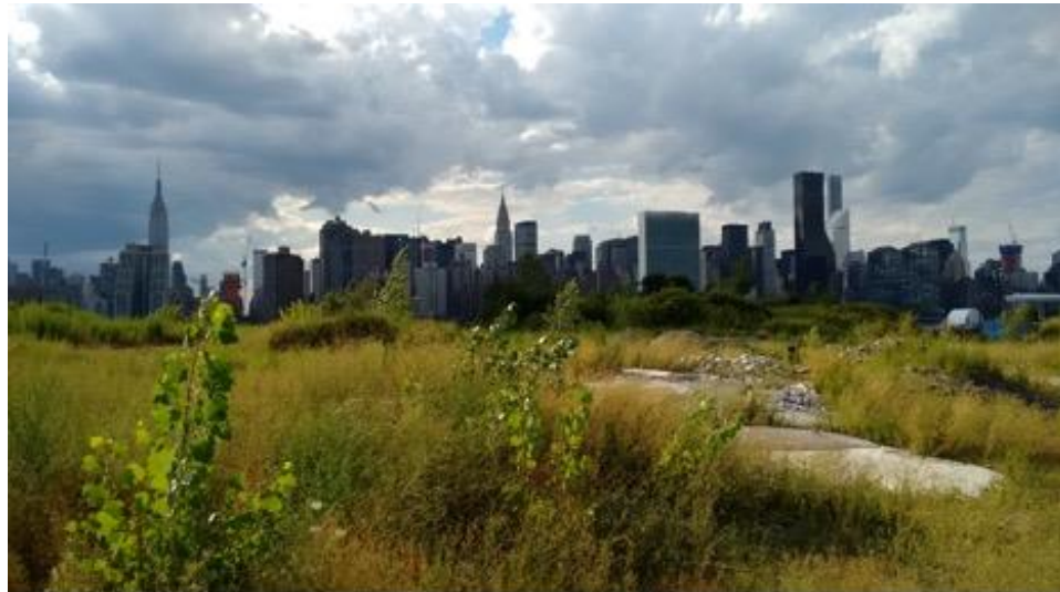
Fig. 2 Hunters Point offered visitors an often sublime mix of nature and urban, 2015.

The performance, repeated again at sunset—at an abandoned campsite deeper into “the Woods” of this waterfront, represented the closing notes of a perhaps 40 year period of sometimes spectacular but mostly quite ordinary engagements with nature on Hunters Point, the part natural and part built peninsula that forms the southwest corner of the borough of Queens (Fig. 2). This 20-plus acre wild site was by January 2016 was just a fraction of what it had been four months earlier. The waterfront’s redevelopment into apartment buildings and a waterfront park was already well underway, and had obliterated the naturally evolved features of this landscape inland. The sleepy city was waking up and the wave of development had swept through New York City’s waterfronts and adjacent, working class neighborhoods had finally reached this proverbial hole in the donut.