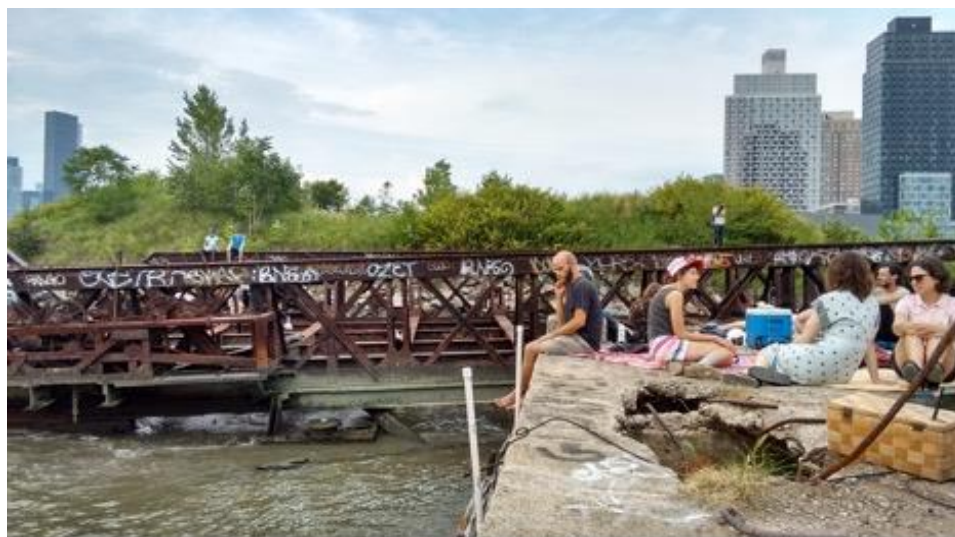
Figure 10. A pirate radio listening party at Hunters Point, 2015. Note the use of the float bridge in the background.

The socially pliable conditions also enabled acts of discovery at greater scales and perspectives, including Laura Chipley's kite mapping project and Sarah Nelson Wright's collection of video and sounds that would eventually become a virtual-reality gallery installation. Using a solar powered transmitter from top of the hill with the flagpole, Dylan Gauthier's "Stolon Station" broadcasted pirate radio to the immediate vicinity. Gauthier's "stolon" was inspired by the rapid spreading of horizontal stems or shallow roots of an insurgent plant to form new plants at this site. During a late summer listening party, Hunters Point field recordings were broadcasted along with interviews and other auditory portions of Chance Ecologies programming (Fig. 10).