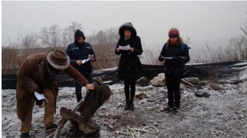
Fig. 1. Chance Ecologies participants perform “For Grieving the Loss of a Wild Landscape,” on the Hunters Point peninsula, Queens, New York City, 2016.