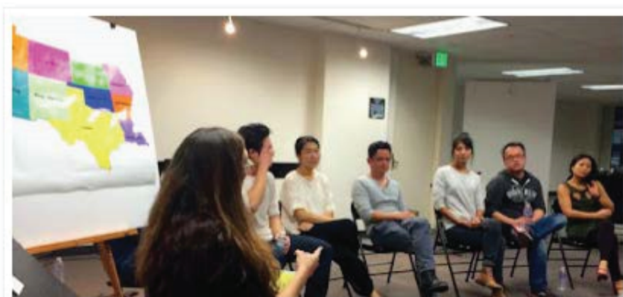
The cast, playwright and director of Vietgone at the post-reading "talk back" with the audience at the Vietnamese American Arts & Letters Association.