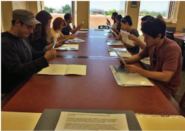
Vietgone actors and creative team looking through the Fort Chaffee photographs in the UCI Libraries Special Collections reading room.