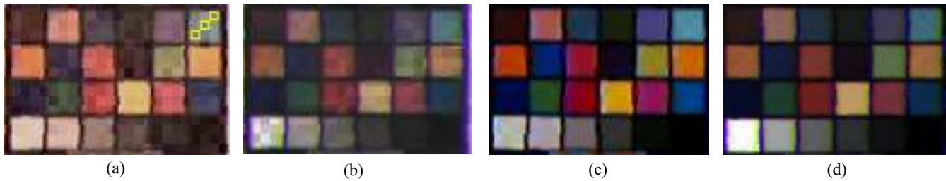
Figure 1: Image composites using blocks from different cameras. Blocks along a diagonal are from one camera. Three such blocks are highlighted in the first image. (a) Data from cameras at default gain and offset. (b) Cameras calibrated using software auto-gain and white-balance. Color inconsistency is significant. (c) Calibration of all cameras to a single standard - sRGB. Color artifacts are less perceptible although still noticeable in the white, yellow, and light green patches. (d) Our method, which calibrates cameras to each other, rather than to a standard. There are minimal artifacts. Note: Artifacts on the edges of color patches are due to demosaicing and geometric misalignment.