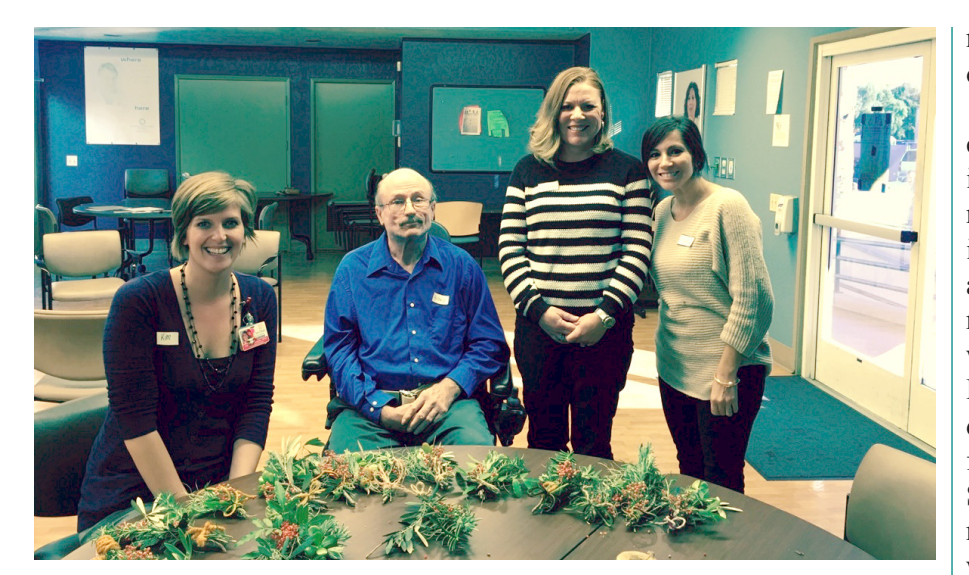
Holiday wreath making Wreaths were passed out to hospitalized stroke survivors over the holidays with an inspirational message of hope.