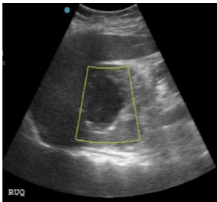
Image 1. Upper quadrant mass seen on emergency physician-performed point-of-care ultrasound. Color Doppler demonstrating no flow (yellow box).

Adrenocortical carcinomas can present as either non-secreting or hormone secreting. 1 The diagnostic workup for ACC includes the measurement of steroid hormones produced by tumor, imaging via contrast-enhanced CT or magnetic