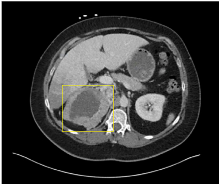
Image 3. Axial computed tomography demonstrating cystic mass in right upper quadrant (yellow box).

resonance, and biopsy if indicated. 2 An ACC can be quite large, which incurs a higher risk of complications such as vasculature obstruction, related to the size of the malignancy. 3 Thus, it is important to identify these tumors expeditiously and begin treatment as soon as possible. The sonographic appearance of ACC is a large, heterogeneous solid or cystic mass positioned adjacent to the kidney. 4