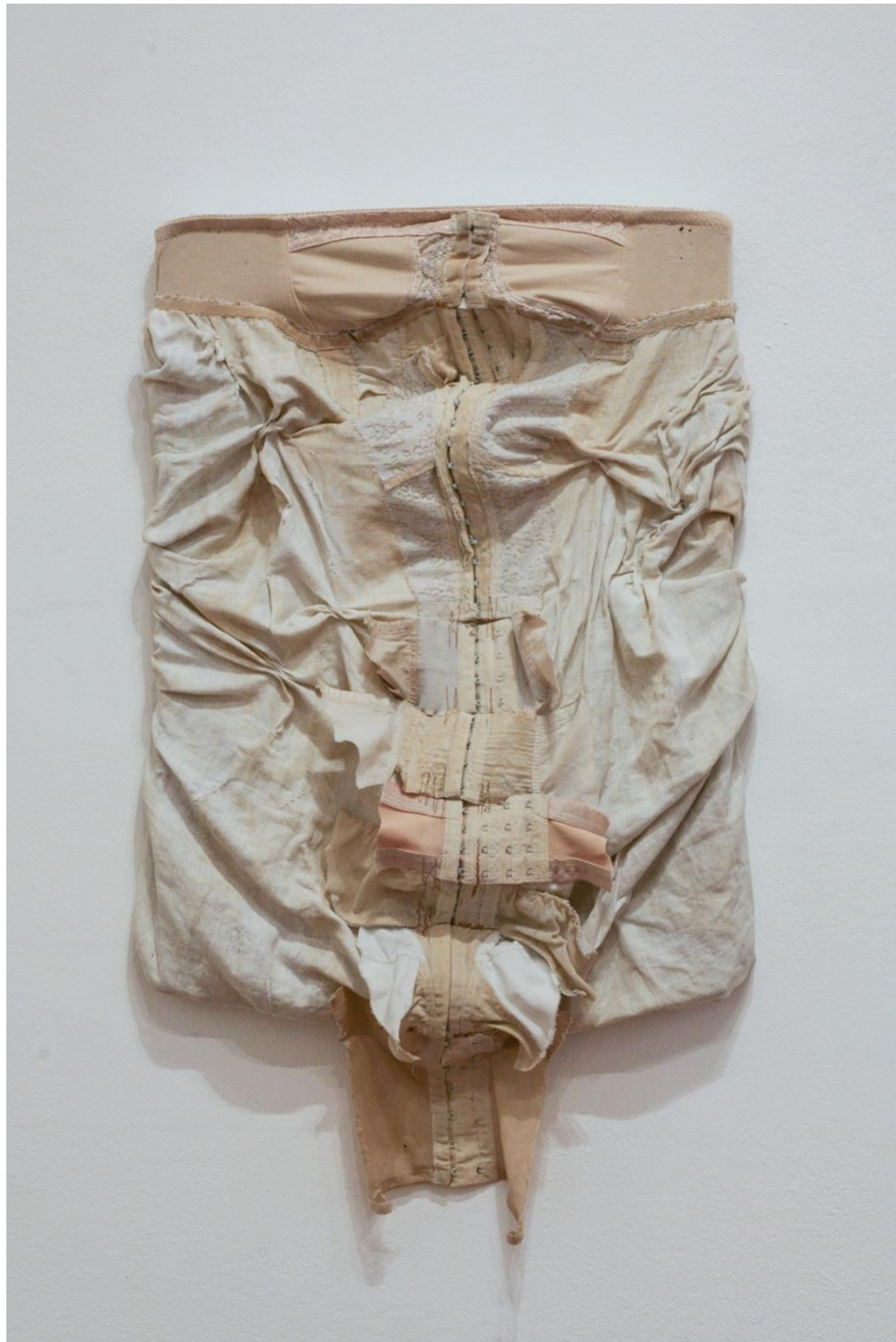
Figure 2 Patricia Belli, La Columna Rota, 1996, brassieres, corsets, and secondhand dresses on wooden frame, 37 × 26.7 in (94 × 68 cm), Artists Collection.