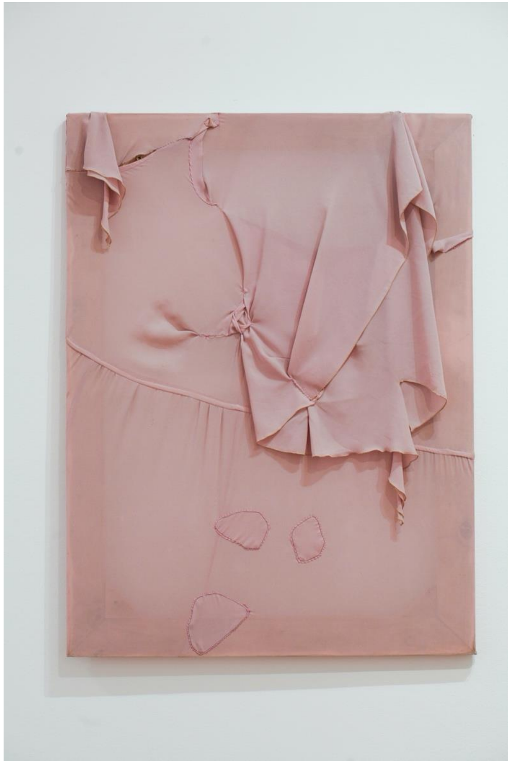
Figure 1 Patricia Belli, Femalia, 1996, secondhand dress on wooden frame, 39.76 × 30.11 in (101 × 76.5 cm), Artists Collection.