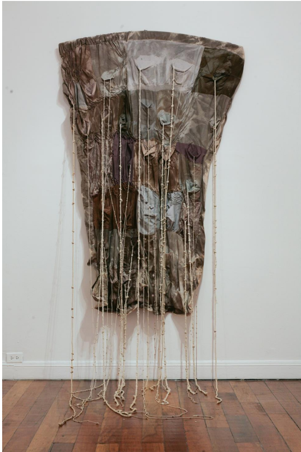
Figure 3 Patricia Belli, Sacos Vacios (Empty Sacks), 1997, secondhand clothes and fiber cords on wooden frame, Artists Collection.