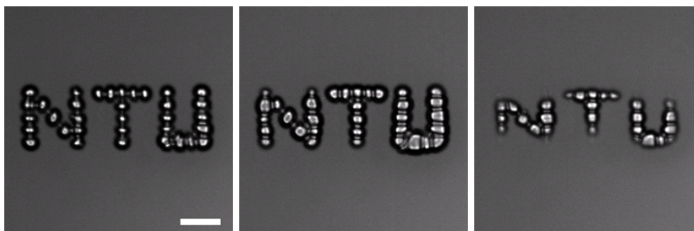
Fig. 3. NTU logo consisting of 34 cavitation bubbles 1.2 \mu\text{s} , 3 \mu\text{s} and 5 \mu\text{s} after the laser pulse ( E=56 \mu\text{J} ). The length of the scale bar is 100 \mu\text{m} .

utility of cavitation bubbles for mixing [27, 12] and pumping [13] fluids or to rupture plasma membranes of cells in microfluidic devices [14]. The use of the digital hologram allows these manipulations to be performed at different locations without scanning the microfluidic chip or the laser beam. This simplifies the experimental setup and allows fluid to be actuated by light and computers only; without any need for mechanical valves, wired connections, scanning mirrors, or position stages with micrometer resolution.