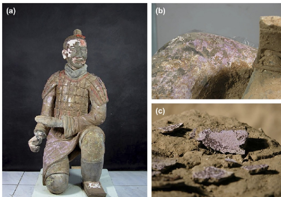
Fig. 1. (a) Warrior # T18G21-08, a kneeling archer. The pigment samples in this study have been taken from this terracotta warrior. (b) Close-up picture of the purple paint on the terracotta warrior. (c) Images of the purple paint samples used in this study.

Synchrotron radiation is 8e12 orders of magnitude more brilliant than the high performance rotating anode X-ray tubes