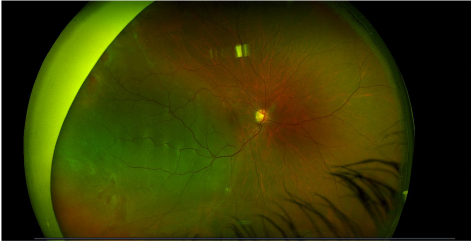
Figure 3. Funduscopy of right eye temporal retinal detachment with multiple retinal holes and detached macula.