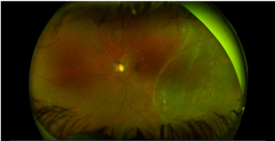
Figure 4. Funduscopy of left eye temporal retinal detachment with multiple retinal holes but intact macula.

days, respectively. Cases of facial swelling and Bell's palsy have also been reported, occurring within 28 days of vaccination (8,9). Individuals with hyaluronic acid dermal fillers have also had more pronounced delayed inflammatory responses, occurring approximately 36 h to eight days after vaccine administration (10).