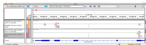
( B. rapa , B. oleracea mapped onto A. thaliana )