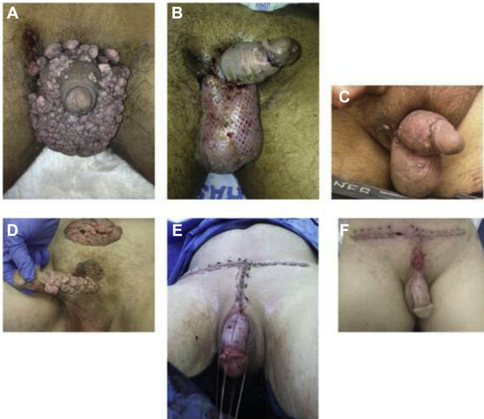
Figure 2. (A) 28-year-old gentleman with Milroy's lymphedema. (B) The involved penile and scrotal skin was excised, meshed STSG applied over the scrotum, and unmeshed STSG applied over the penis. (C) Graft at 3 months. (D) 57-year-old gentleman with condyloma accuminatum involving the penis and the pubic region. (E) All the involved skin was excised. Unmeshed STSG was applied over the penis, and pubic wounds were closed primarily. (F) Picture taken at 1 month. Part of the pubic wound was opened due to wound infection on postoperative day 4. (Color version available online.)

surgeons reported the same success of STSG in lymphedema 7,9,14 ; the largest was a case series of 350 patients with elephantiasis. 12 In this study, we report the success of STSG in lymphedema due to a wide range of etiologies (primary, postpelvic radiation/surgery, hypospadias repair, Klippel-Trenaunay-Weber, and Milroy's lymphedema). We also report here the success of STSG in covering the defects from tissue loss due to Fournier's gangrene or any other etiology. We typically apply the graft during the same admission once the wound is stabilized, and no more debridement is needed. We usually mesh penile graft in contaminated wounds. Black et al 2 reported the use of meshed penile grafts in all cases of tissue loss. Chen et al 15 reported the use of STSG in cases where there is a large surface area of tissue loss in Fournier's gangrene.