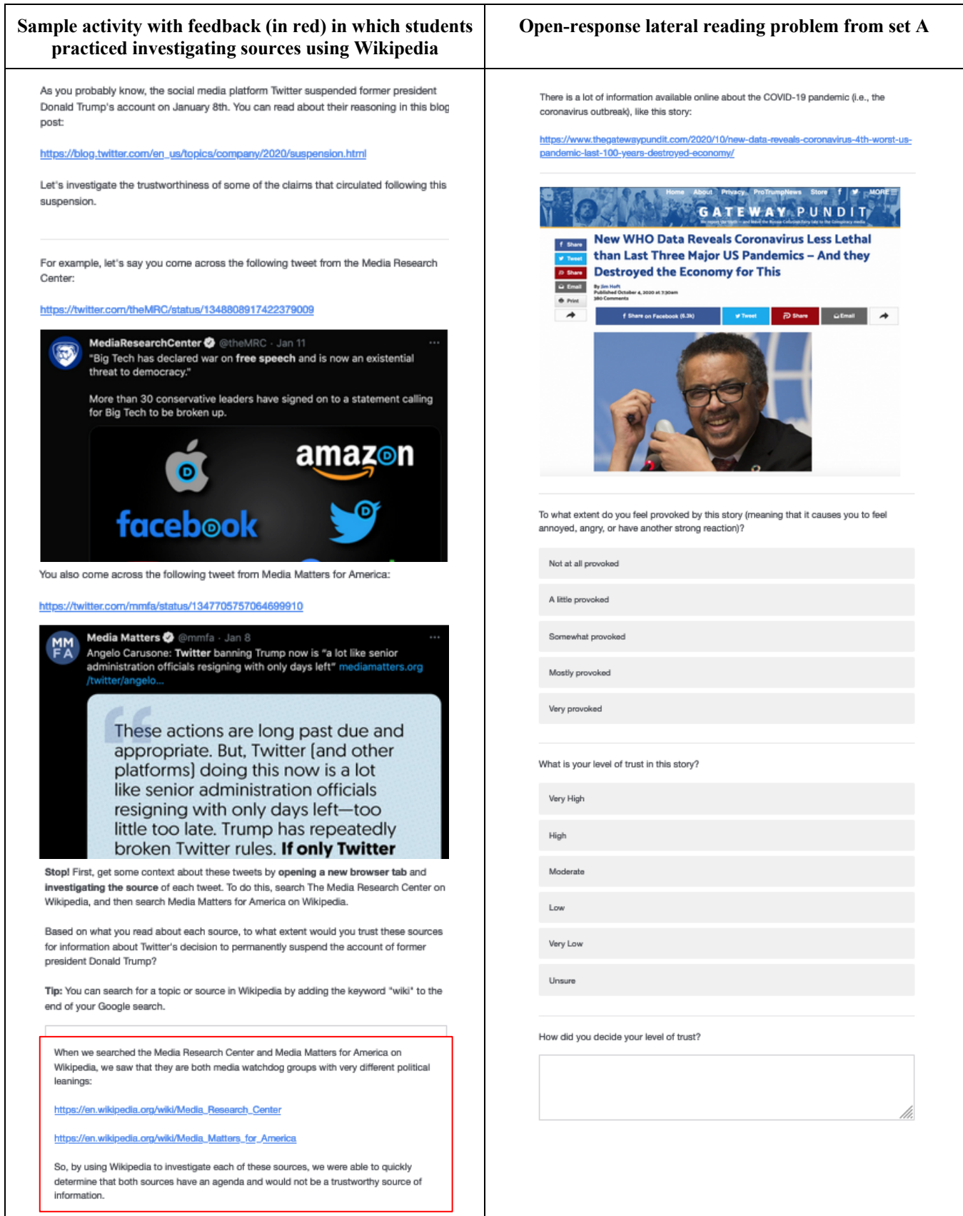
Figure 1: Screenshots of sample instructional activity [left panel] and open-response lateral reading problem [right panel].