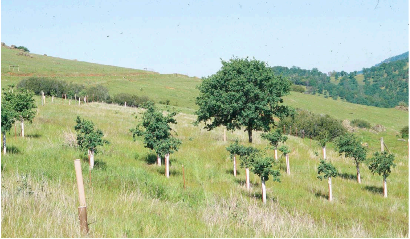
Tree shelters helped to get blue oak seedlings established and growing rapidly in an oak regeneration plot at SFREC.

soilborne organisms.) They discovered that oaks and pines have a diverse fungal community on their roots that aids in nutrient uptake. Mycorrhizae also play a critical role in oak establishment (Berman and Bledsoe 1998), water uptake (Millikin and Bledsoe 1999) and nitrogen capture (Cheng and Bledsoe 2004).