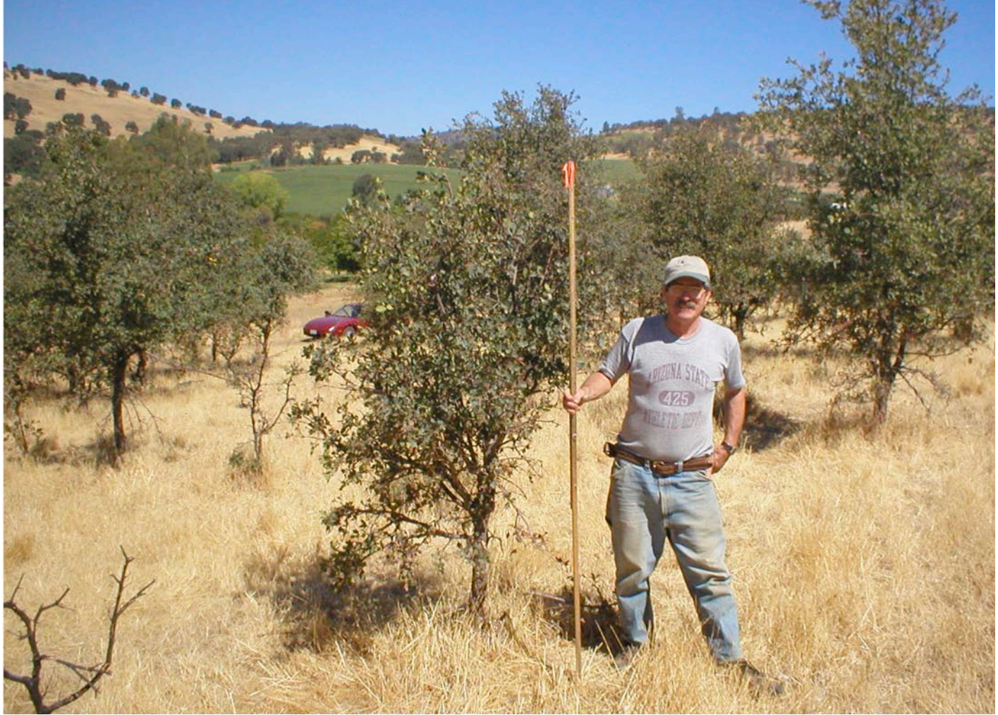
Decades of research at SFREC have helped to establish guidelines for regenerating oaks in grazed woodlands. Staff research associate Jerry Tecklin demonstrates that blue oaks more than 6.5 feet (2 meters) tall are relatively resistant to cattle impacts, while seedlings shorter than 6.5 feet are adversely affected.

each, so using them over large areas would likely be prohibitively expensive for most private landowners. Cost-share programs (that help subsidize the cost of purchasing and installing tree shelters) to encourage hardwood restoration are common in Great Britain and other parts of Europe, but are generally not available in California (McCreary and Kerr 2002).