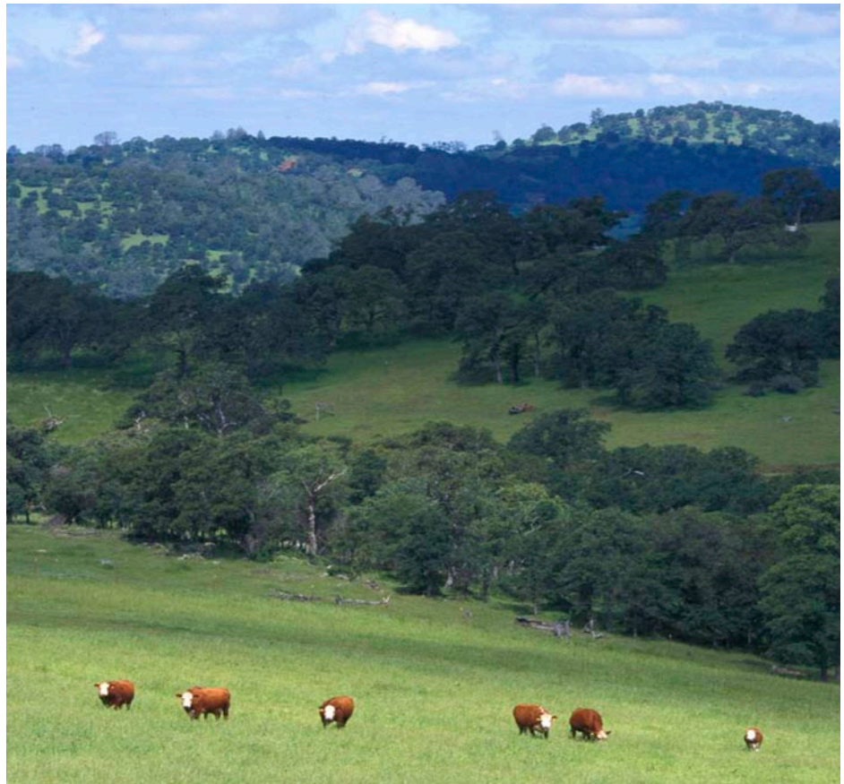
Jack Kelly Clark

During the last 25 years, a wide variety of oak woodland research has been conducted at the UC Sierra Foothill Research and Extension Center. A substantial portion of this research has focused on developing procedures for artificially regenerating native California oaks. Results indicate that oaks can be successfully established with sufficient care and protection, including thorough weed control and protection from damaging animals. Tree shelters, or grow tubes, have proven particularly useful in getting seedlings to about 6.5 feet (2.0 meters), where they are relatively resistant to cattle browsing. These findings have been disseminated through training sessions and written materials and have been widely adopted by restoration practitioners, improving the overall success rate of oak plantings in California.