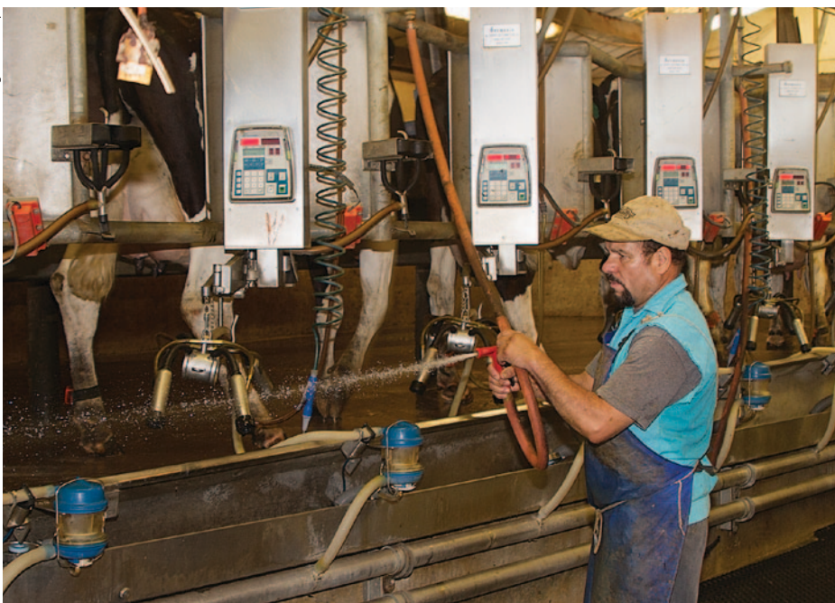
In a recent survey of San Joaquin Valley dairy workers, the reasons most often cited for leaving employment were compensation and benefits, economic problems at the dairy, and personal and family matters.