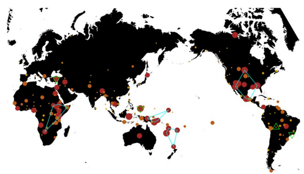
Map 1A: Codes for Generosity (v334) Map 1B: Codes for Agriculture (v2137) Moderate-Strong Weak-0-Hunting proxy vs. 1-Agriculture