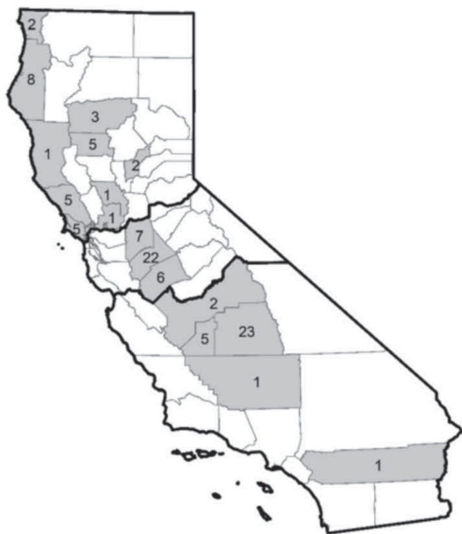
Figure 2. Map of counties in northern California (top section), northern San Joaquin Valley (middle section), and greater southern California (bottom section). Shaded areas contain counties and number of dairies per county sampled for a study of 100 California dairies surveyed between May 2014 and April 2016 relating management practices to bovine respiratory disease prevalence.

refrigerated then frozen. A variable for colostrum storage temperature had indicator variables for each of the 4 storage temperatures. The type of storage container for colostrum was dichotomized as solid (R) or bags, as thawing frozen colostrum stored in bags may achieve a more uniform increase in colostrum temperature compared with colostrum stored in plastic bottles and may result in less heat damage to immunoglobulins. The variable for percent of colostrum fed that is from first-calf heifers was dichotomized into the categories any or no (R) colostrum from first calf heifers. The amount of colostrum fed in the first 12 h was dichotomized into <2.84 L (R) or \geq 2.84 L (3 quarts), as feeding 3 L of colostrum was considered a relevant biological cutpoint (Godden et al., 2009). Four dairies let calves nurse from their dams to meet the calves' colostrum needs; hence, estimates for the amount of colostrum fed in the first 12 h on these dairies could not be made. In addition, a dichotomous variable for whether or not (R) colostrum was tested for immunoglobulin content and a dichotomous variable for whether or not (R) calves were assessed for failure of transfer of passive immunity based on serum total protein were explored in the model.