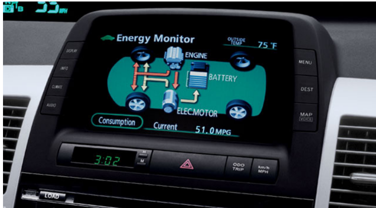
Figure 2: Toyota MFD Energy Monitor Screen