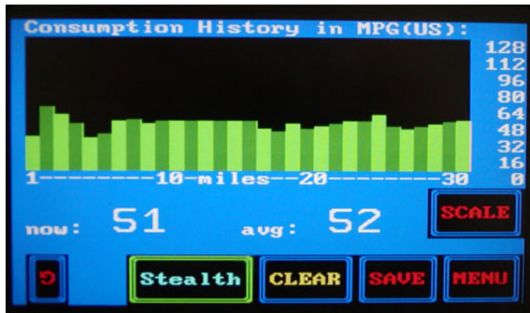
Figure 3: CAN-view