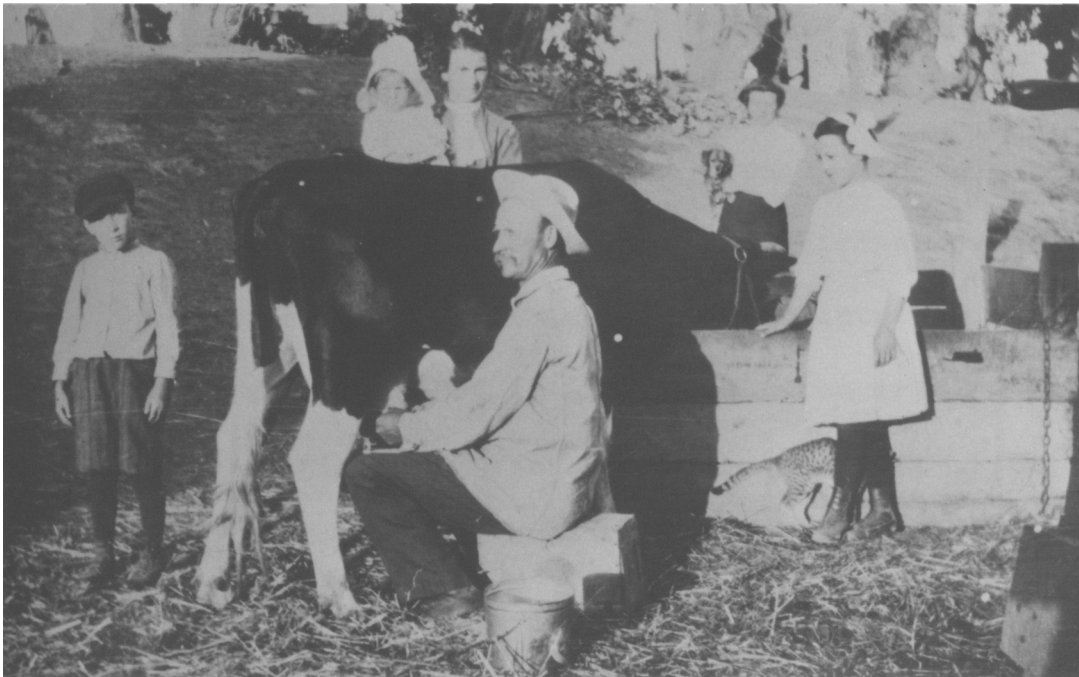
The McHenry Farm, Lompoc, California, 1912