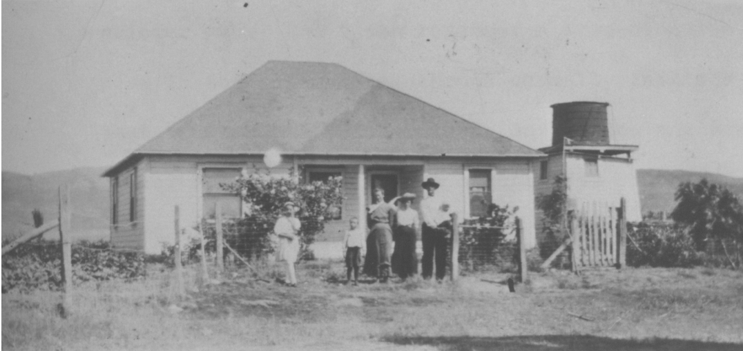
The McHenry Farm, Lompoc, California, 1912