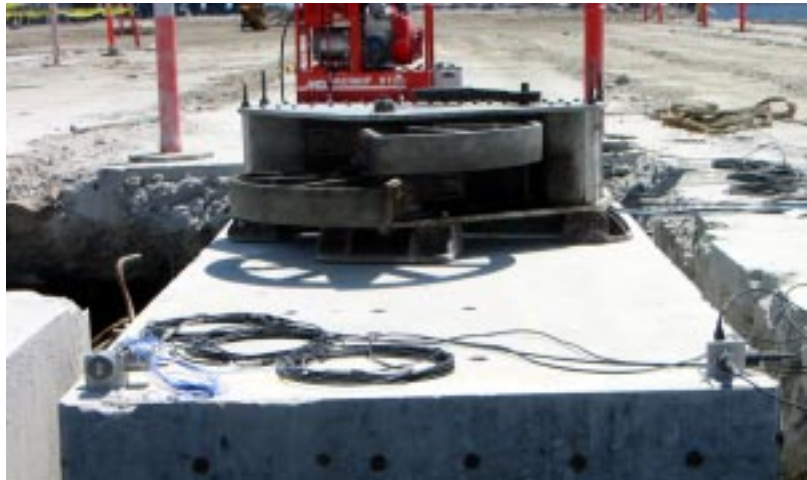
A 5,000 pound rotating shaker vibrates sections of a Long Beach pier at different frequencies to identify the structure's natural harmonics. More vigorous shaking simulates ground motions that might be felt during an earthquake.

In the first stage of testing, the pier was vibrated to determine its fundamental modes of vibration from which structural characteristics such as stiffness are inferred. In the