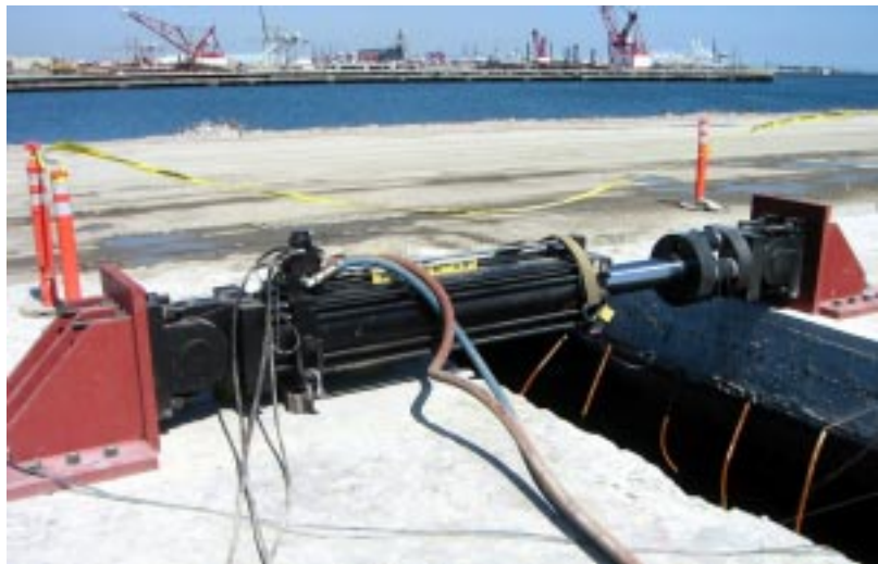
A hydraulic piston bolted to two sections of the pier slowly expands, subjecting it to lateral loads that might be experienced during an earthquake.

second stage, it was tested vigorously with a 5000-pound rotating shaker to simulate how the pier might respond to ground motions caused by a quake.