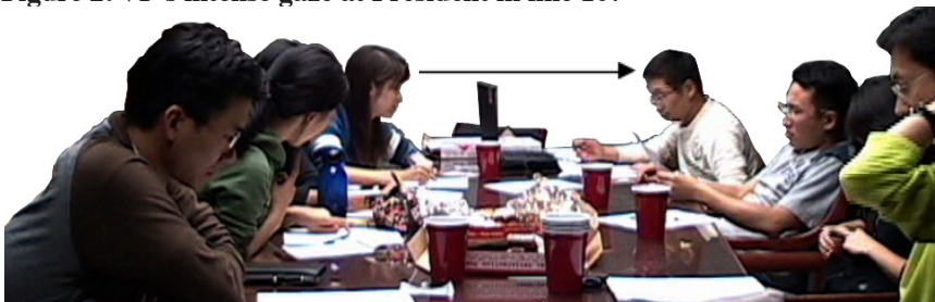
Figure 2. VP's intense gaze at President in line 107

VP's direct proposal succeeds in not only obtaining P's response, but an acceptance, as shown in Excerpt (9). VP, while asserting her argument, had been using the intimate level of speech in imperative all along, but none of the assertions had been accepted or answered. It should then be noted that the approach that VP takes in line 107 in terms of language, sequential position in the interaction and reasoning was much more successful in getting a response. Indeed, VP's utterance so strongly requires a second pair part that everyone in line 108 looks at P for a pause of (1.5).