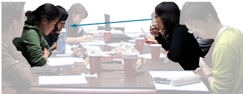
Figure 1. Soc 3's gaze at Soc 1 and Soc 2 in lines 43-44

It is worth noting that Soc 3's reasoning is heading towards the provision of the ex-president's opinion as an account and that it is at this point that Soc 3's utterance is interdicted by Web. Web's interdiction in line 45 begins with kuntey ("but"), projecting a counter account (Park, 1997, 1998), and displays his understanding that Soc 3 was providing the Socials' account.