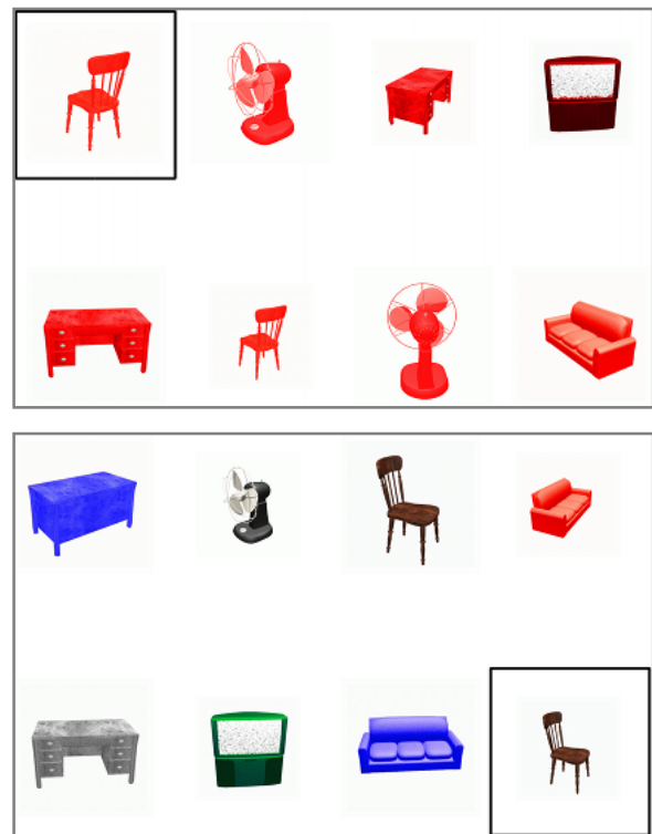
Figure 3: Examples of critical trials in Experiment 2: for the low variation condition (upper picture) and for the high variation condition (lower picture). Manipulations of colour may not be visible in a black and white print of this paper.

Figure 3 depicts examples of trials in the two conditions of experiment 2. In all critical trials, mentioning ‘type’ plus one other attribute (‘orientation’ or ‘size’) was sufficient to produce a distinguishing description of the target. Again, mentioning ‘colour’ was never needed to distinguish the target. As in Experiment 1, the trials were built in such a way that algorithms like the Incremental Algorithm would never include ‘colour’ in their target descriptions. In the low variation condition in figure 3, the algorithm would not select ‘colour’ because all pictures have the same colour. In the high variation condition in figure 3, the algorithm will