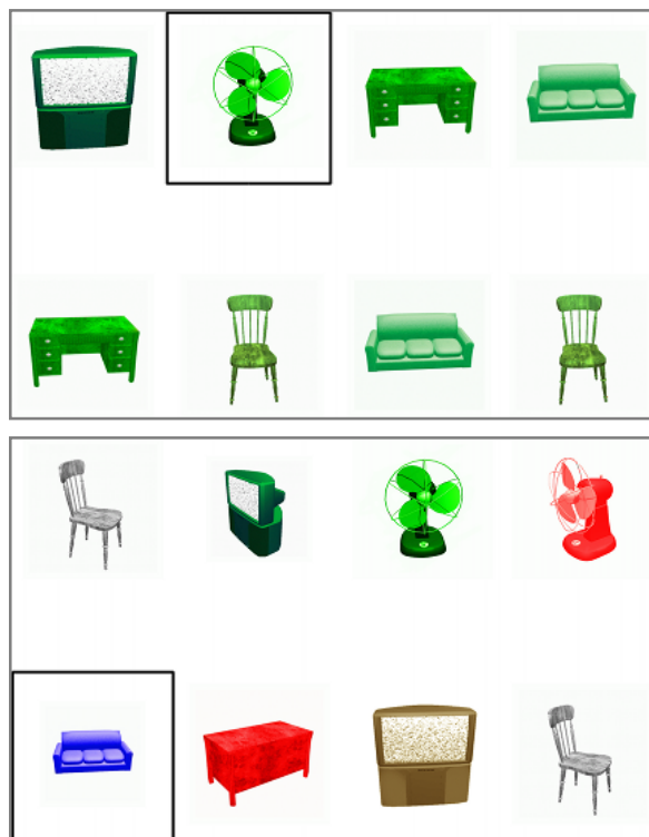
Figure 1: Examples of critical trials in Experiment 1: for the low variation condition (upper picture) and for the high variation condition (lower picture). Manipulations of colour may not be visible in a black and white print of this paper.

Design and statistical analysis Experiment 1 had a within participants design with Scene variation (levels: low, high) as the independent variable, and the average number of referring expressions containing a colour attribute (as explained below) as the dependent variable. Our statistical procedure consisted of two repeated measures ANOVAs: one on the participants means with the participants as the random variable ( F1 ), and one on the item means with the items as the random variable ( F2 ).