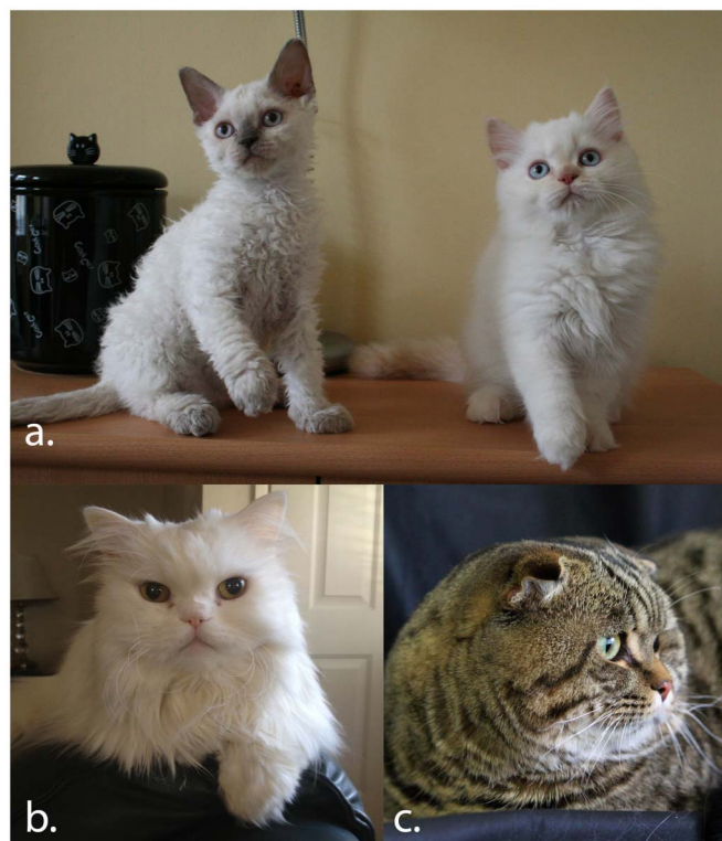
Figure 1 | Phenotypic variation within the Persian-family of cat breeds. (a) Phenotype of the Selkirk Rex breed characterized by a curly coated cats (left) as well as straight hair cat (right) and moderate brachycephaly. (b) Phenotype of the Persian breed characterized by straight long hair and moderate brachycephaly. (c) Phenotype of Scottish Fold breed characterized by folded ears and moderate brachycephaly.

A genome-wide association analysis of nine cases (curly coated Selkirk Rex) and 29 controls (six straight Selkirk Rex, five Persian and 18 Scottish Fold) was performed. After genotyping pruning of the 62,897 array SNPs for low minor allele frequency (MAF) and poor SNP genotypes, 10,344 SNPs were removed from further analysis due to a MAF < 5\% and 677 SNPs failed missingness ( GENO > 0.2 ). The highest significant association was identified on cat chromosome B4 at position 81,264,280 (Felis_cats 6.2/felCat5 release) (Figure 2). The P values, chromosomal location and SNP frequency of the 10 most associated SNPs are presented in Table 1. After performing permutations to correct P_{raw} values for multiple hypothesis testing, 13 SNPs on chromosome B4 reached genome wide significance ( P_{genome} = 0.00058 for SNP B4.96694363 at position 81,264,280), as well as one less significant SNP on chromosome B3 ( P_{genome} = 0.02 ) and 2 on