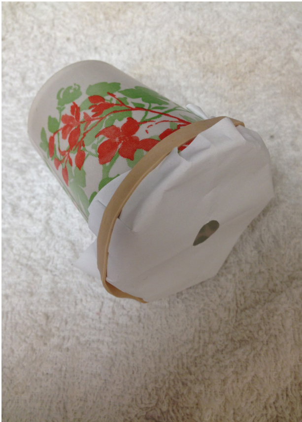
Figure 5. Eye models made from cups with pathology pictures inside. Pathologies included central retinal artery and vein occlusion and retinal detachment.

the teaching session. Overall the improvement in confidence levels was statistically significant across all portions of the ophthalmologic examination after completing the 40-minute teaching session (Figure 6).