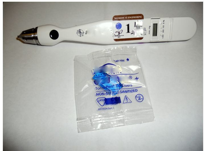
Figure 3. Tonometer.

We found that the average confidence level before the teaching session were below 2 on a 1-4 Likert scale (1 being the least confident). Confidence levels in using the slit lamp had the highest improvement (2.17 95% CI [1.84-2.49]). Students reported the least improvement in their confidence in testing extraocular movements (0.73, 95% CI [0.30-1.71]) and pupillary function (0.73, 95% CI [0.42-1.04]) (Table 2). Table 2 shows the mean confidence level for each ophthalmologic examination that had normal distribution. The differences in confidence level between before and after teaching sessions