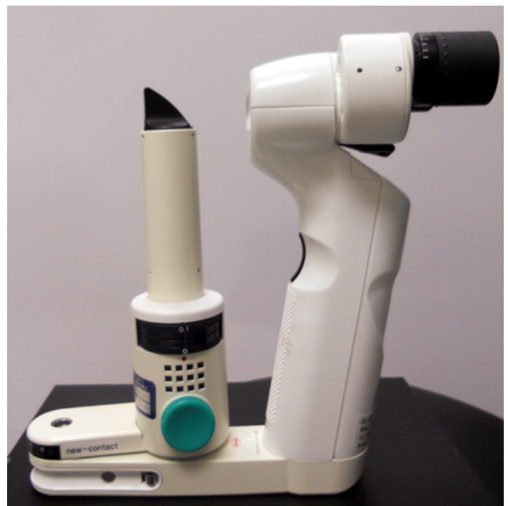
Figure 2. Portable slit lamp.