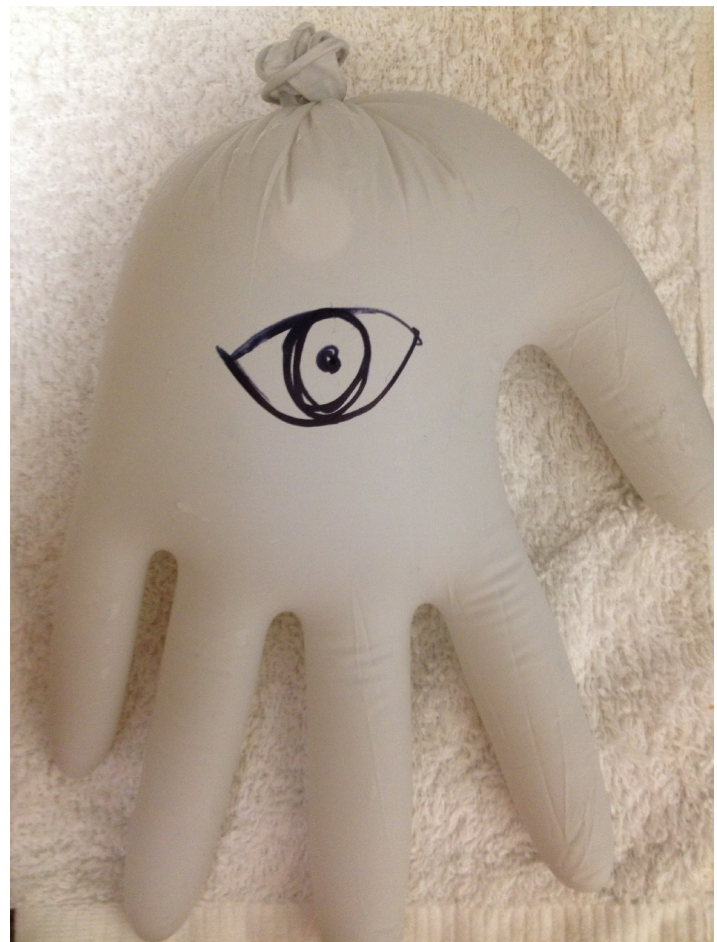
Figure 4. Eye model made of glove filled with water.