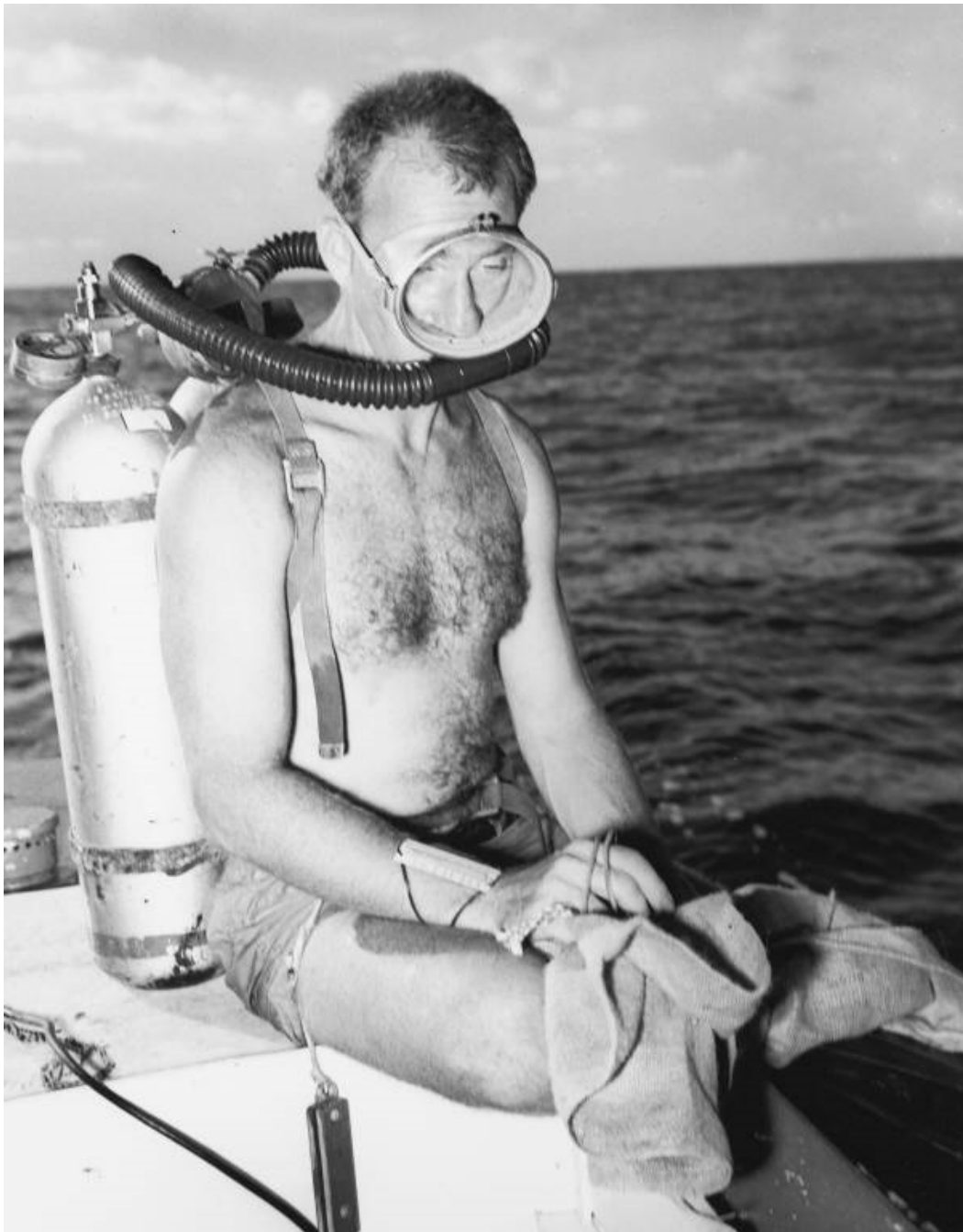
Walter Munk , Capricorn Expedition, 1952

Munk was a participant in the 1952-1953 Capricorn Expedition, one of a long and successful series of expeditions to the deep Pacific organized under the leadership of Roger Revelle. In addition to his other scientific work, Munk joined a small band of scuba divers on Capricorn, the first oceanographic expedition to include a scuba team.