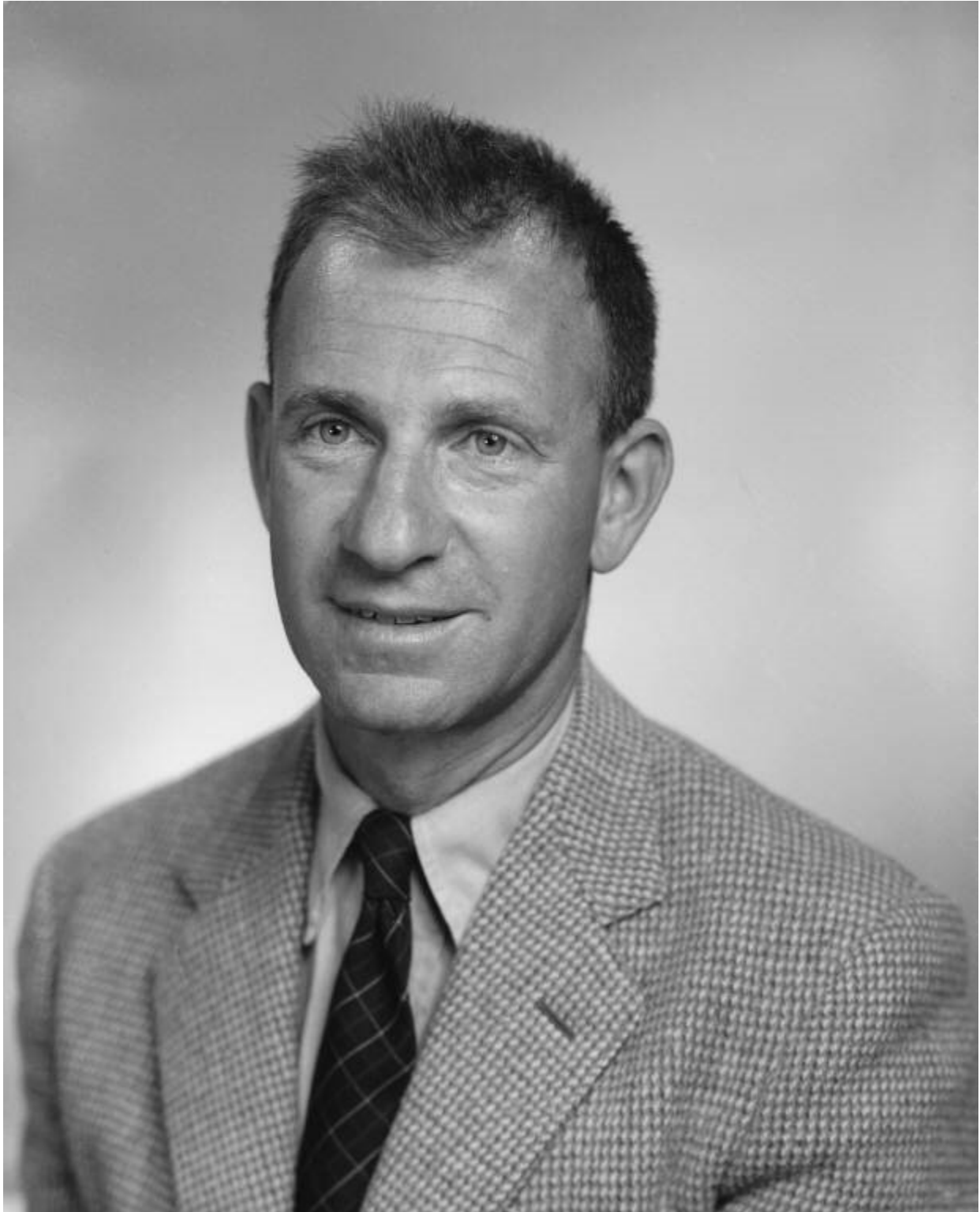
Walter H. Munk, June 1956