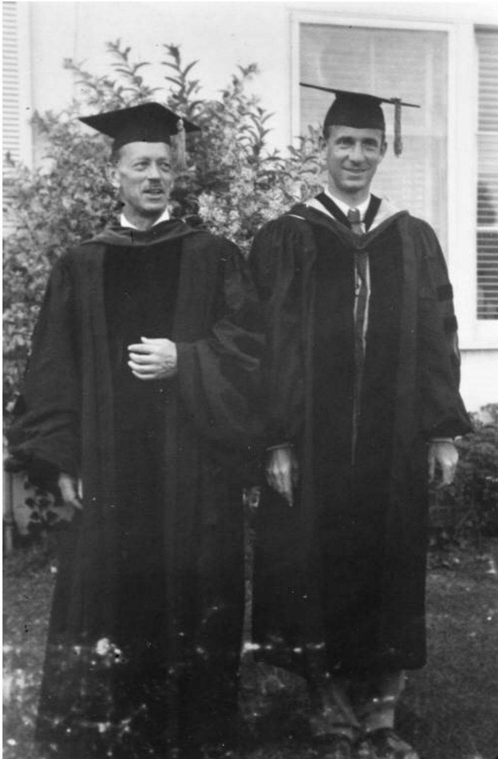
Harald Sverdrup and Walter Munk, 1946