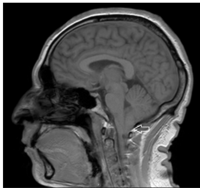
Figure 1. MR brain T1-weighted sagittal view identifying the cerebellar tonsillar herniation/low-lying pointing cerebellar tonsils below the foramen magnum that is typically seen in Chiari I malformations.

Neurology assisted with assessment and management. Frequent neurologic checks were stable. Physical and occupational therapy assessments identified no rehabilitative needs. Surgical intervention was not recommended given the location and risk for complications. With neurologic stability and no evidence of syrinx progression he was discharged home with close neuro and PCP follow-up. He was strongly recommended against further cervical spinal manipulation.