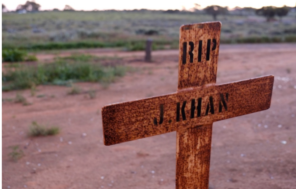
Figure 4 Cross depicting J. Khan, Port Augusta Cemetery, South Australia, 2014.