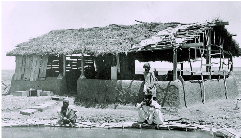
Figure 3 One of the earliest documented mosques in Australia, Hergott Springs (officially renamed Marree in 1883), South Australia, 1884.

documentation (Australian linguist Jane Simpson lists some of these records), but there is much less than I expected.