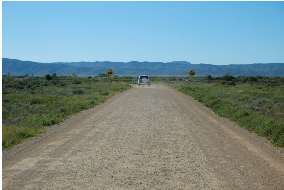
Figure 1 The Australian outback in a four wheeled drive near Port Augusta, South Australia, 2014.

experience on this desert mission is expressed through the emotions, experiences, and senses of self I seek. While these emotions are mine and not necessarily in any way those of the cameleers, I believe such sentiments can offer special insight into the relation between the Afghans and the places they lived and worked. From buildings through signs, spatial(ly violent) behaviour, and architectural pilgrimage, I notice a connectedness worth measuring. I want to write as much about architecture (strong in the sense that it is present, you can touch it, it is hard) and that which is gentle yet weak (namely the dusty remains of architecture no longer), as much about strength as the violence of time and what it confiscates from our vision. That is, I want to know and experience how time can forcefully remove previously strong artefacts like buildings and appropriate their physical memory.