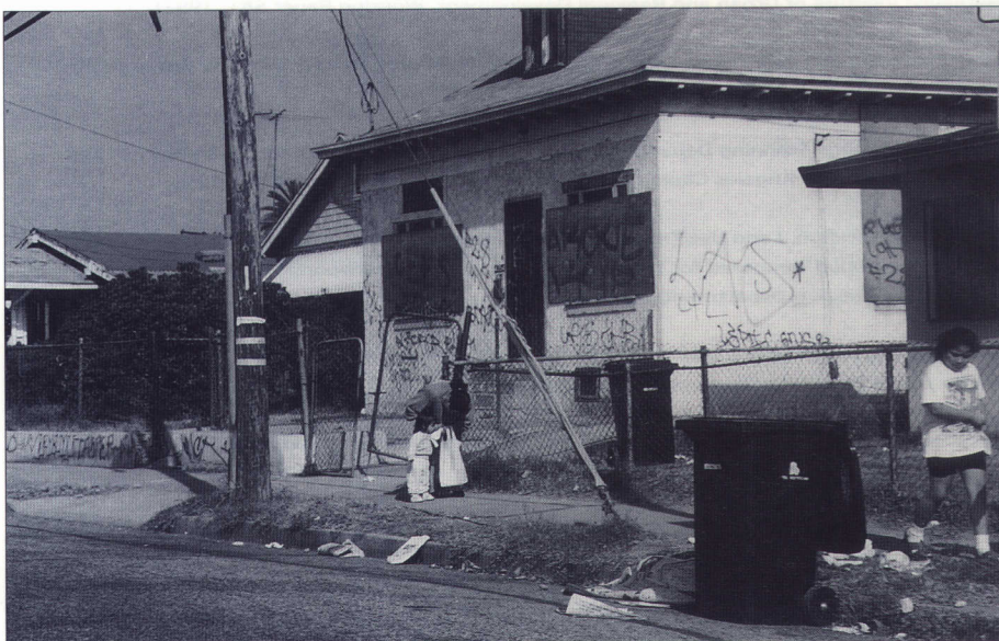
A Blue Line station's neighbor.

Are rail transit agencies willing to invest in risky inner-city projects? So far, the answer for the Blue Line is clearly no. Strong public initiatives and commitments for restructuring development patterns at stations have been absent. >