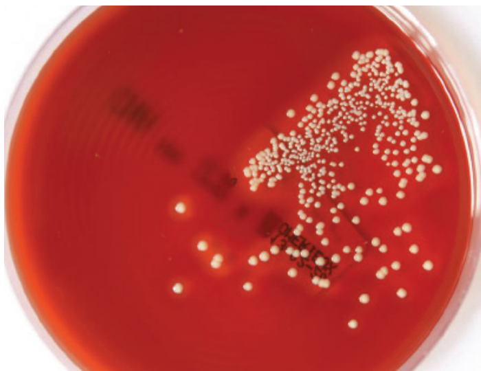
Figure 2. Staphylococcus lugdunensis cultured from the sample of one of the cutaneous lesions.

The histological examination revealed an acute inflammation infiltration involving sweat glands with epithelial proliferation. Periodic acid Schiff and human herpes virus-8 stains were negative. Culture and sensitivities from all the tissue samples collected demonstrated a pure growth of a S.lugdunensis , with subsequent laboratory-initiated speciation performed by broad-range polymerase chain reaction enabling its identification ( Figure 2 ). The bacterium was methicillin-resistant but was susceptible to vancomycin. Excellent results were observed within 5 days of therapy with intravenous vancomycin, 1 g twice daily. The patient underwent 10 days of treatment with no recurrence.